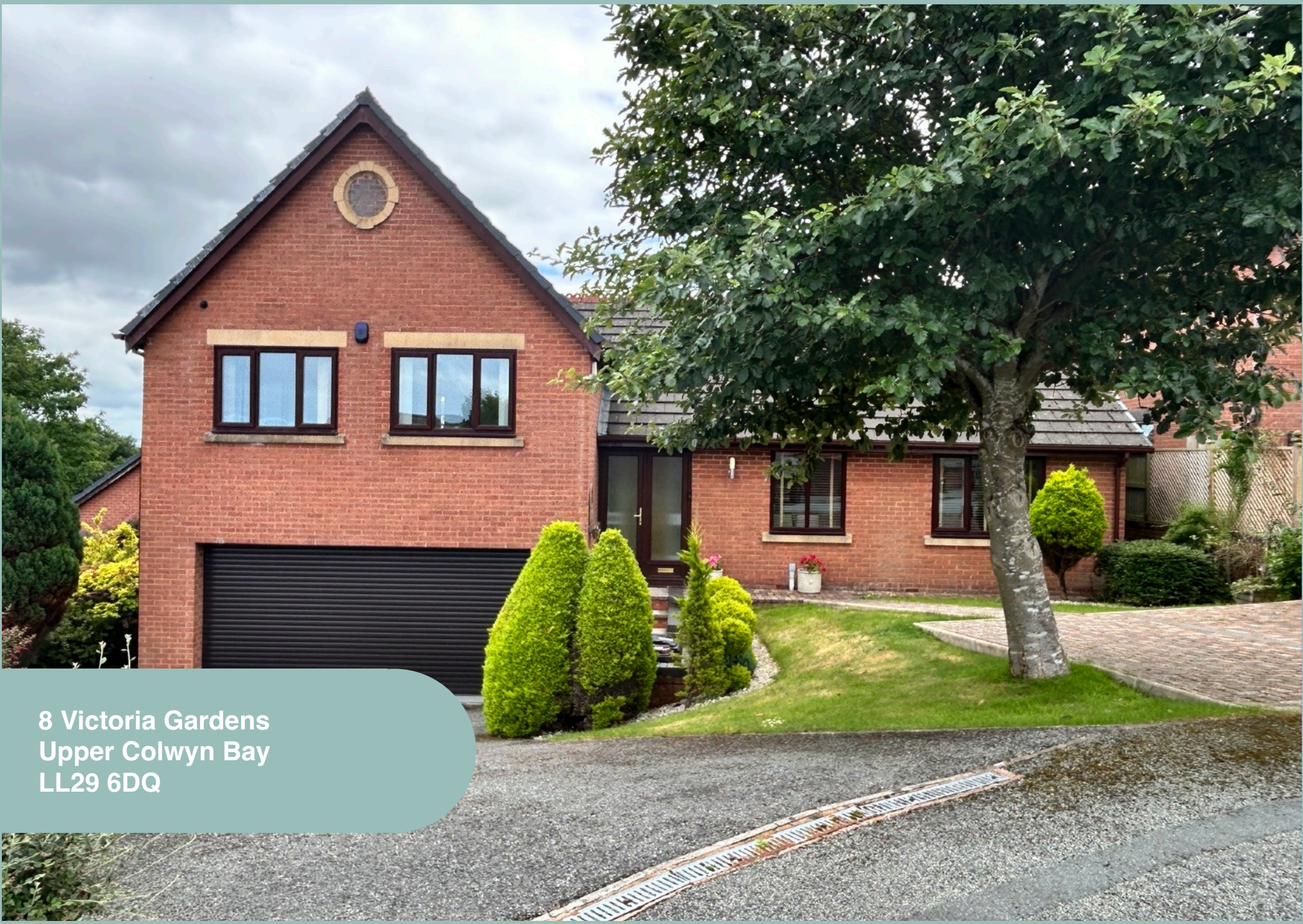
8 Victoria Gardens Upper Colwyn Bay LL29 6DQ