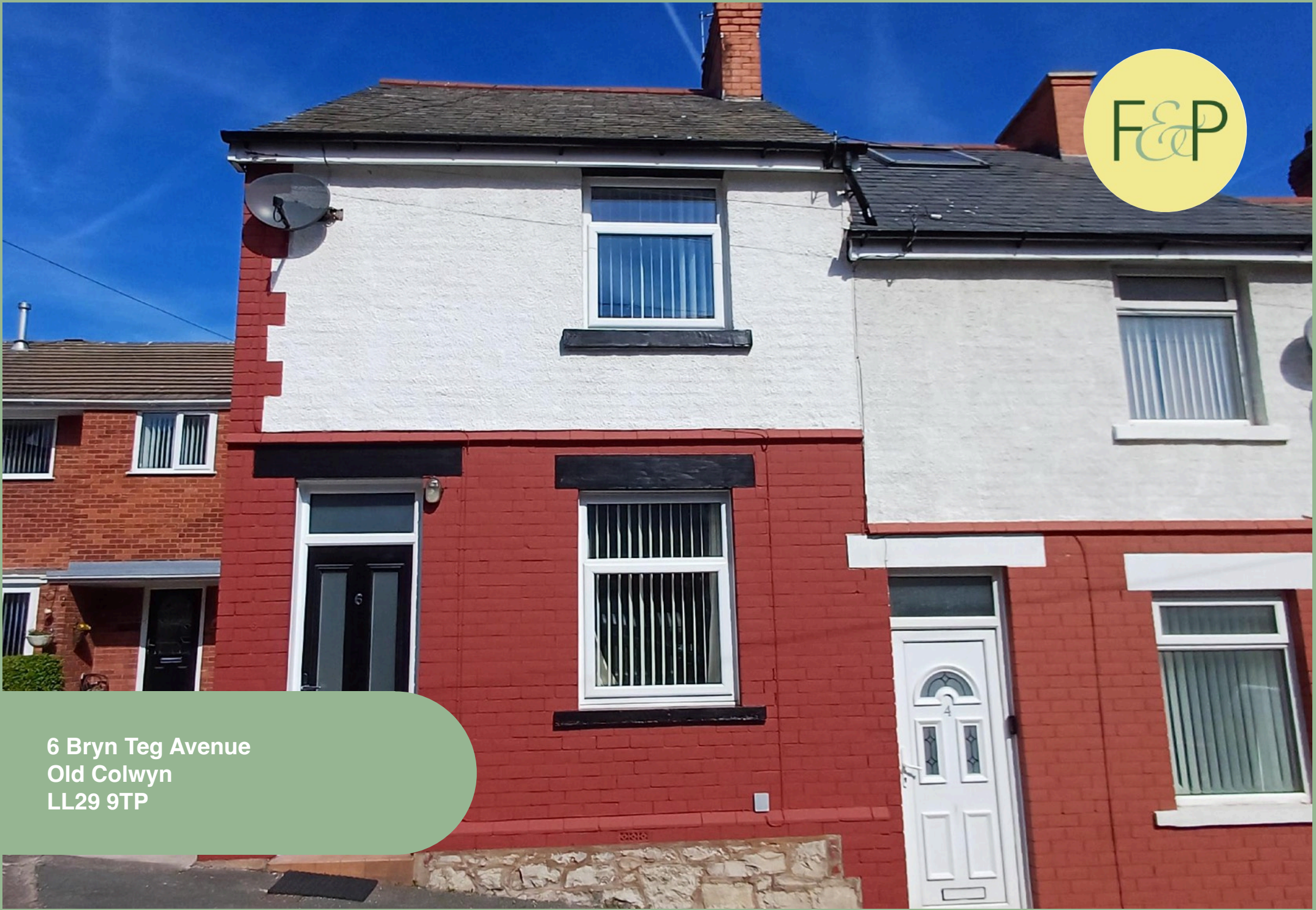
6 Bryn Teg Avenue Old Colwyn LL29 9TP