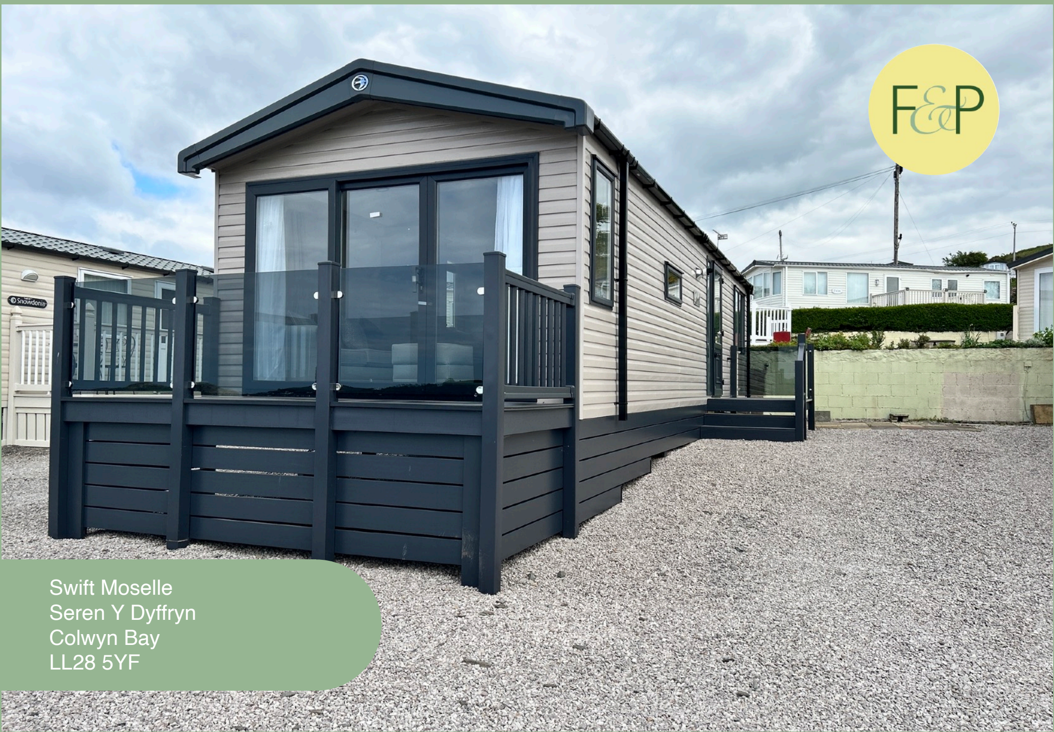
Swift Moselle Seren Y Dyffryn Colwyn Bay LL28 5YF