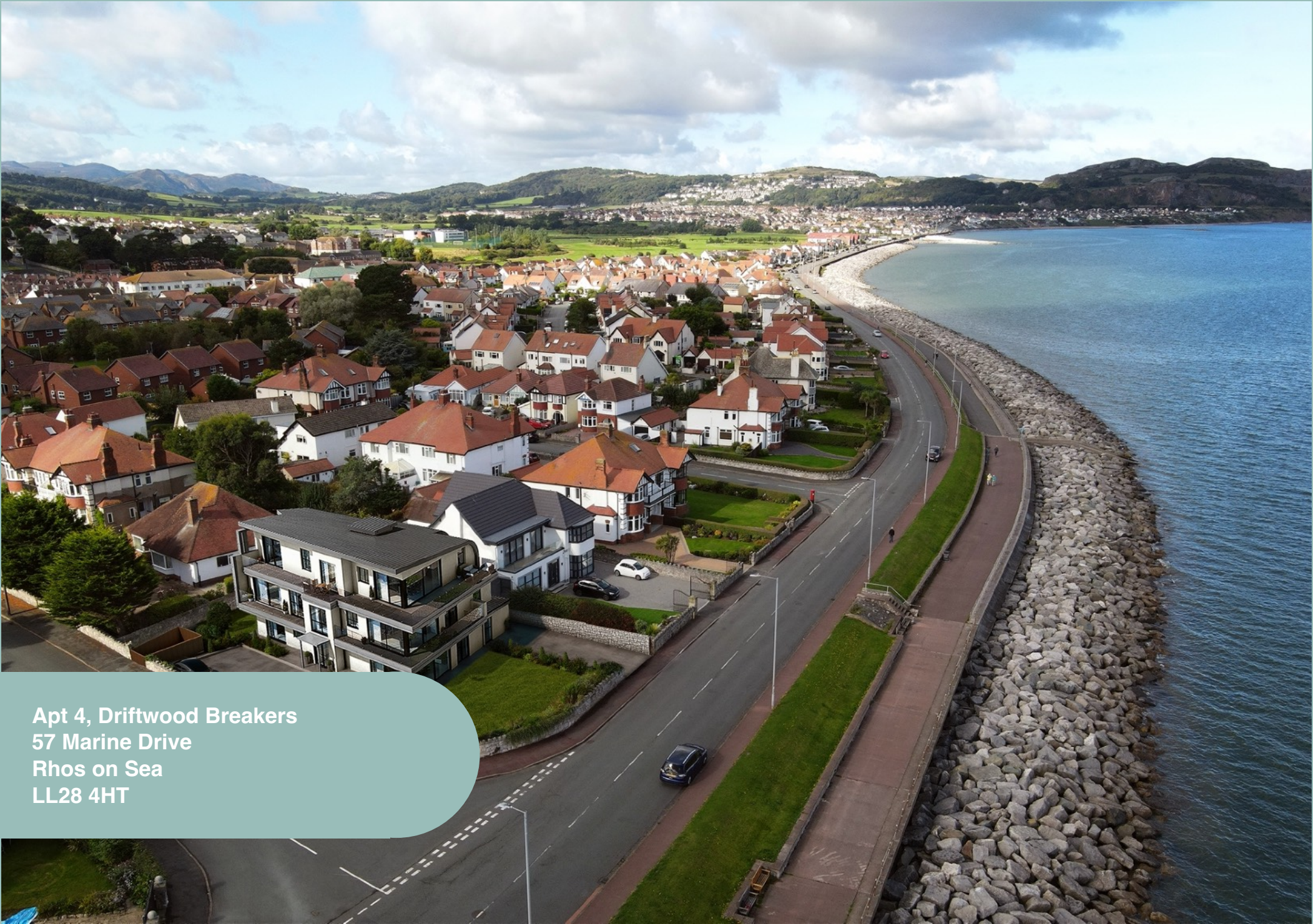
Apt 4, Driftwood Breakers 57 Marine Drive Rhos on Sea LL28 4HT