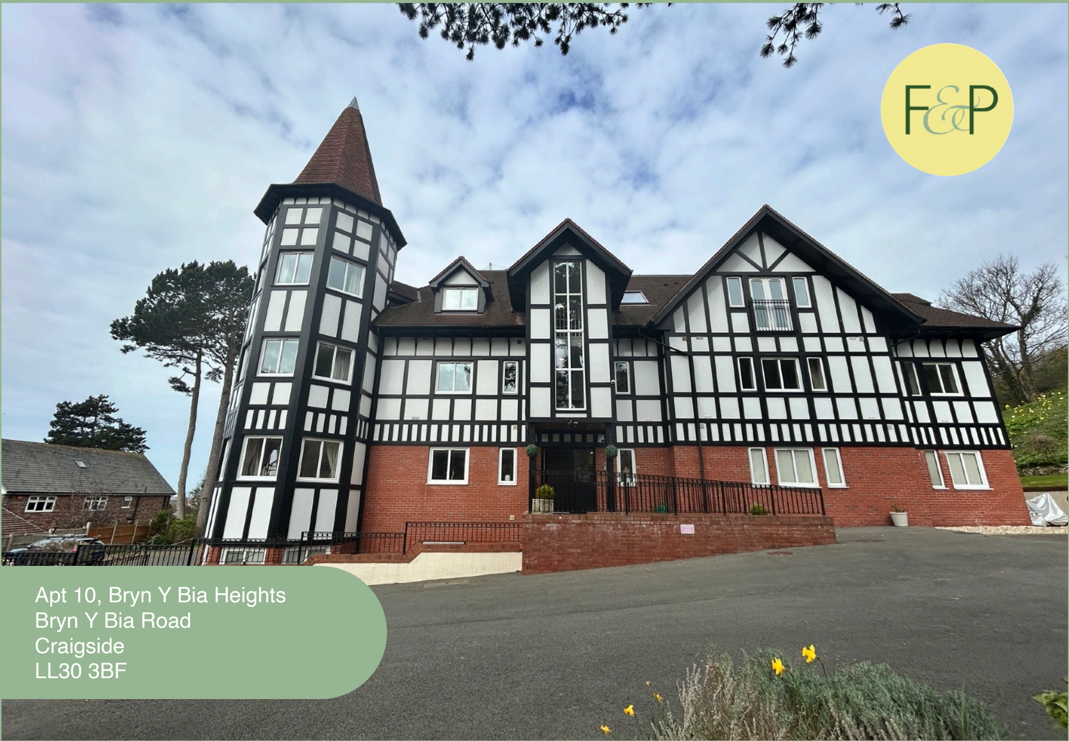
Apt 10, Bryn Y Bia Heights Bryn Y Bia Road Craigside LL30 3BF