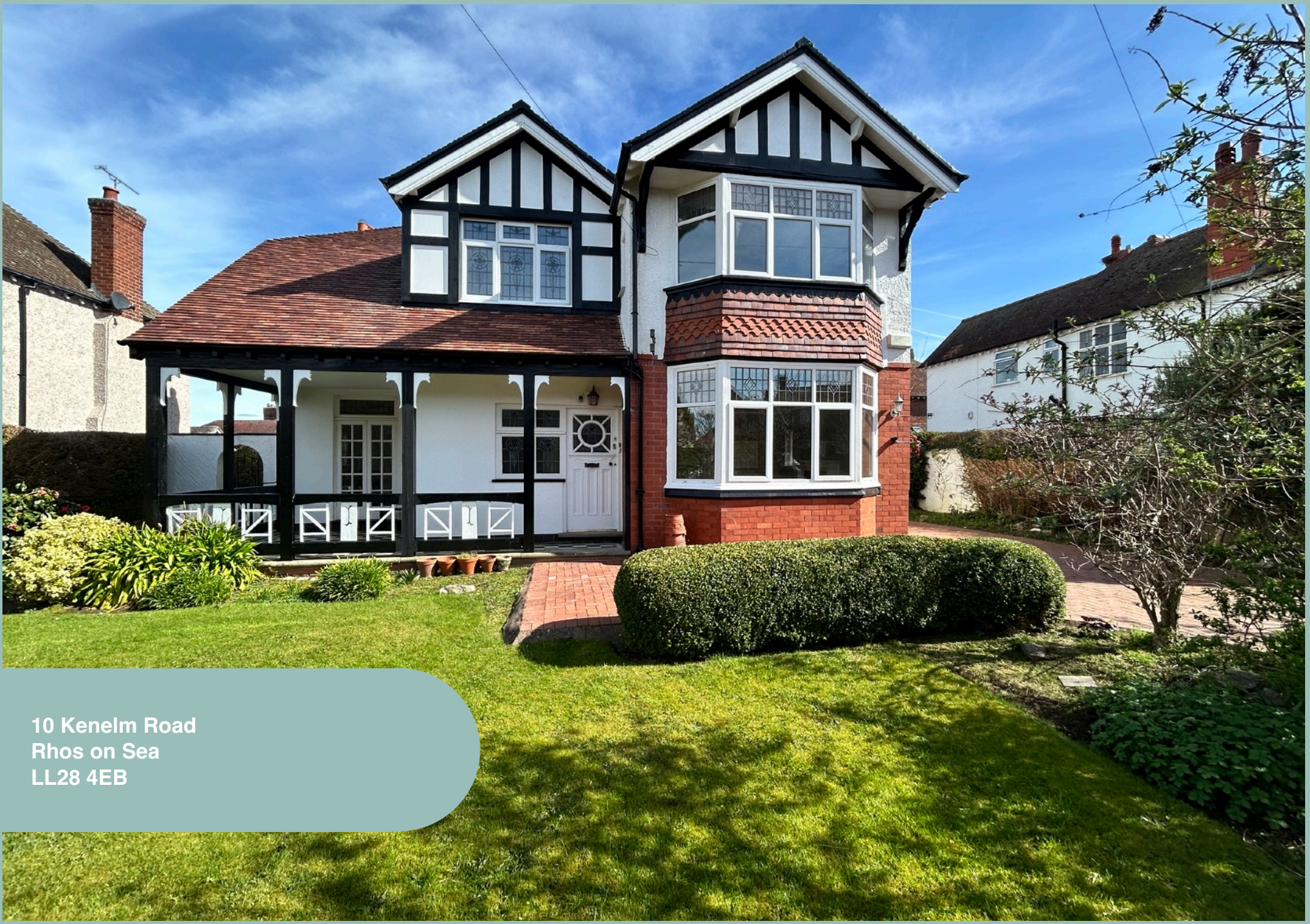
10 Kenelm Road Rhos on Sea LL28 4EB