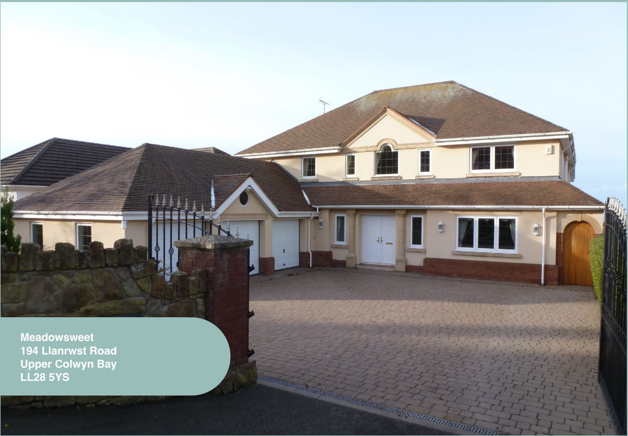
Meadowsweet 194 Llanrwst Road Upper Colwyn Bay LL28 5YS