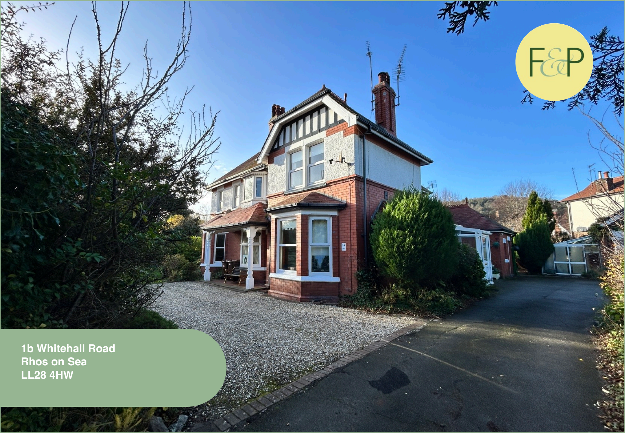
1b Whitehall Road Rhos on Sea LL28 4HW