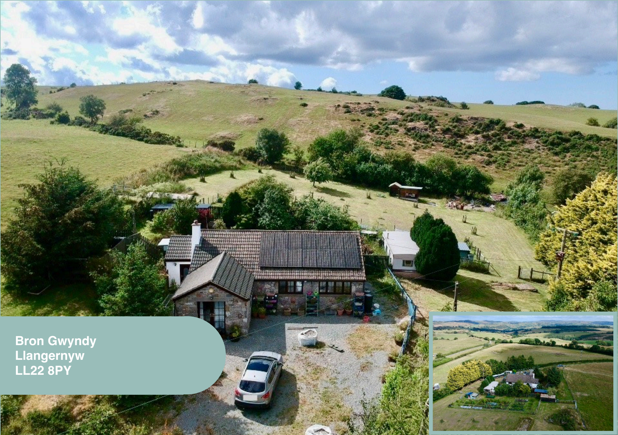
Bron Gwyndy Llangernyw LL22 8PY