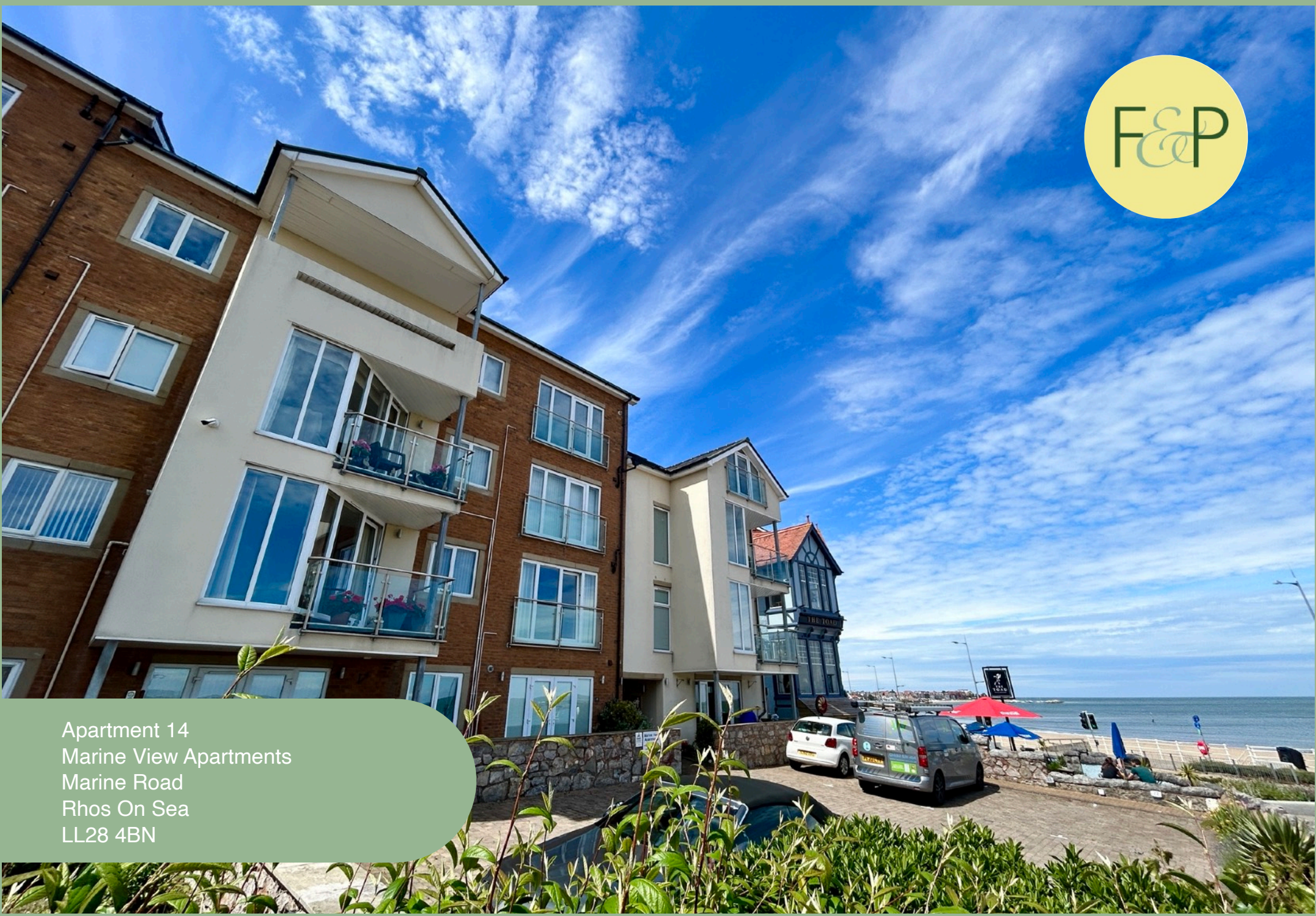
Apartment 14 Marine View Apartments Marine Road Rhos On Sea LL28 4BN