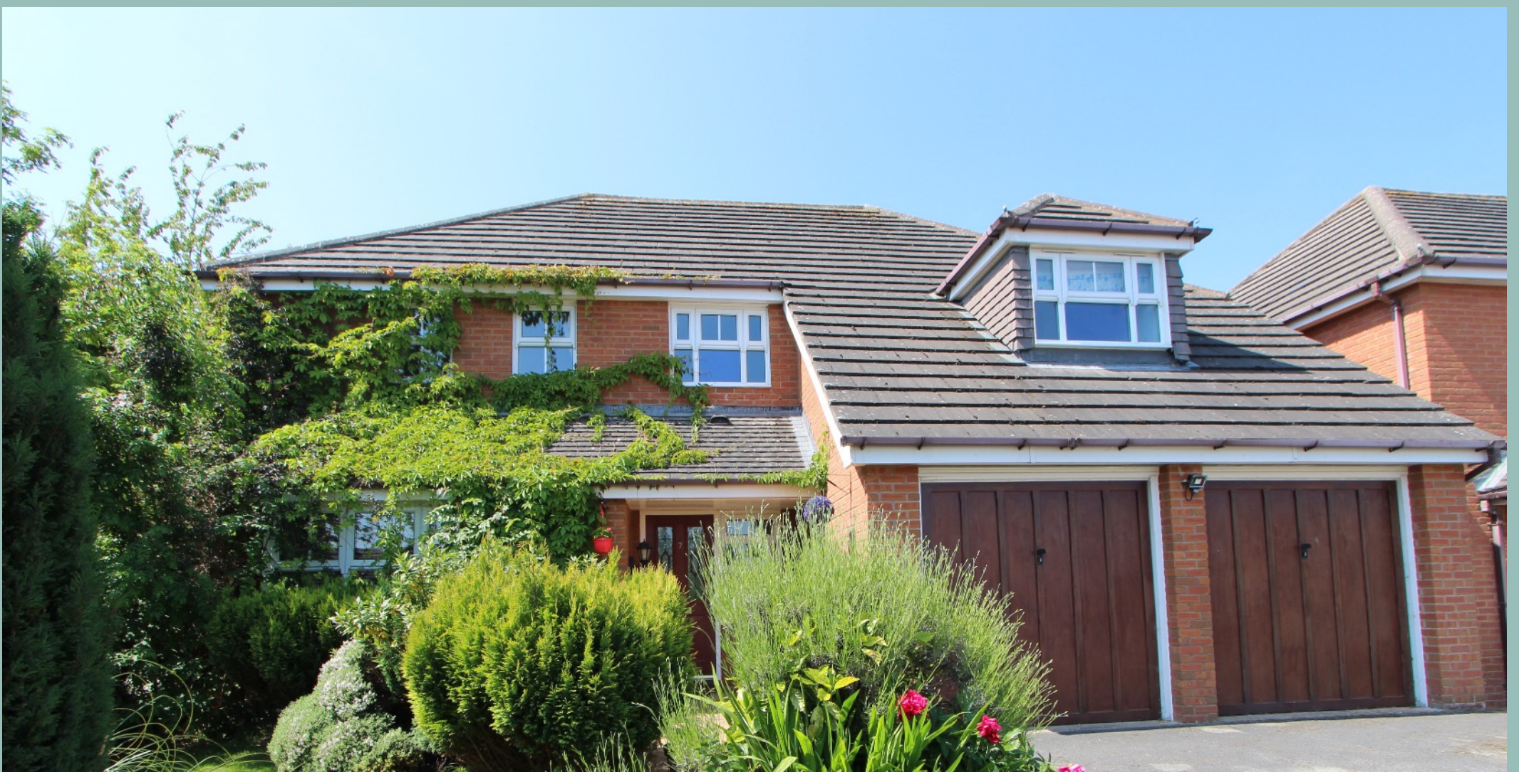
7 Rhodfa'r Carneddau Upper Colwyn Bay LL29 6EE