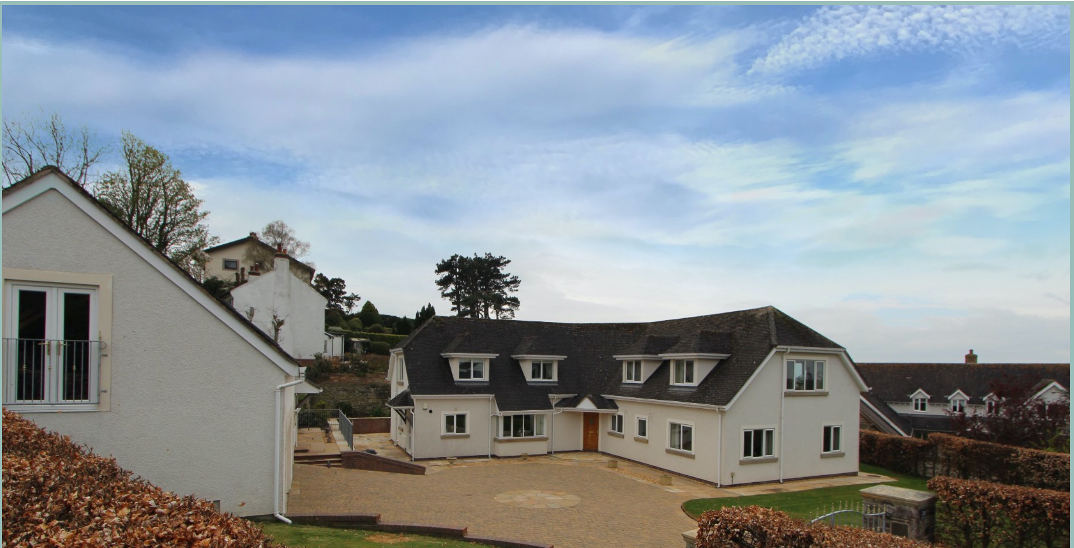
Beechcroft 218 Llanrwst Road Upper Colwyn Bay LL28 5YS