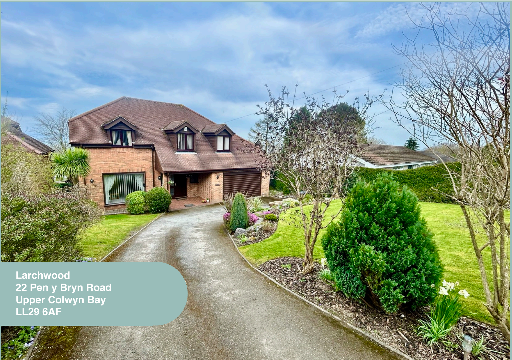
Larchwood 22 Pen y Bryn Road Upper Colwyn Bay LL29 6AF