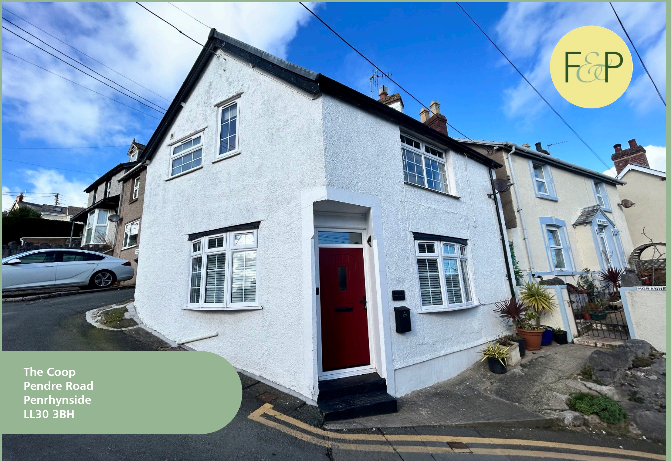
The Coop Pendre Road Penrhynside LL30 3BH