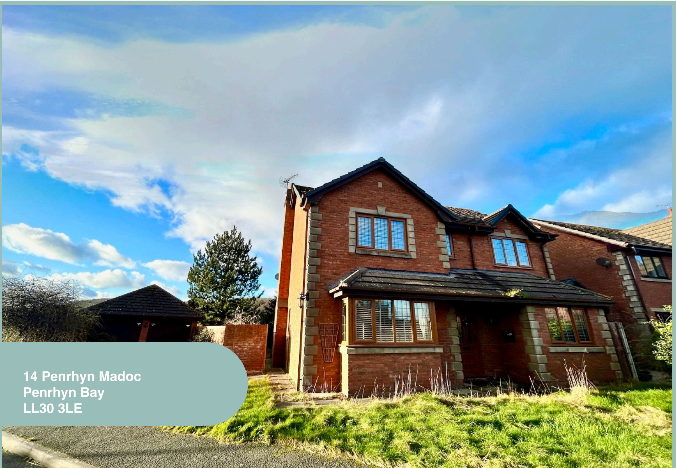
14 Penrhyn Madoc Penrhyn Bay LL30 3LE