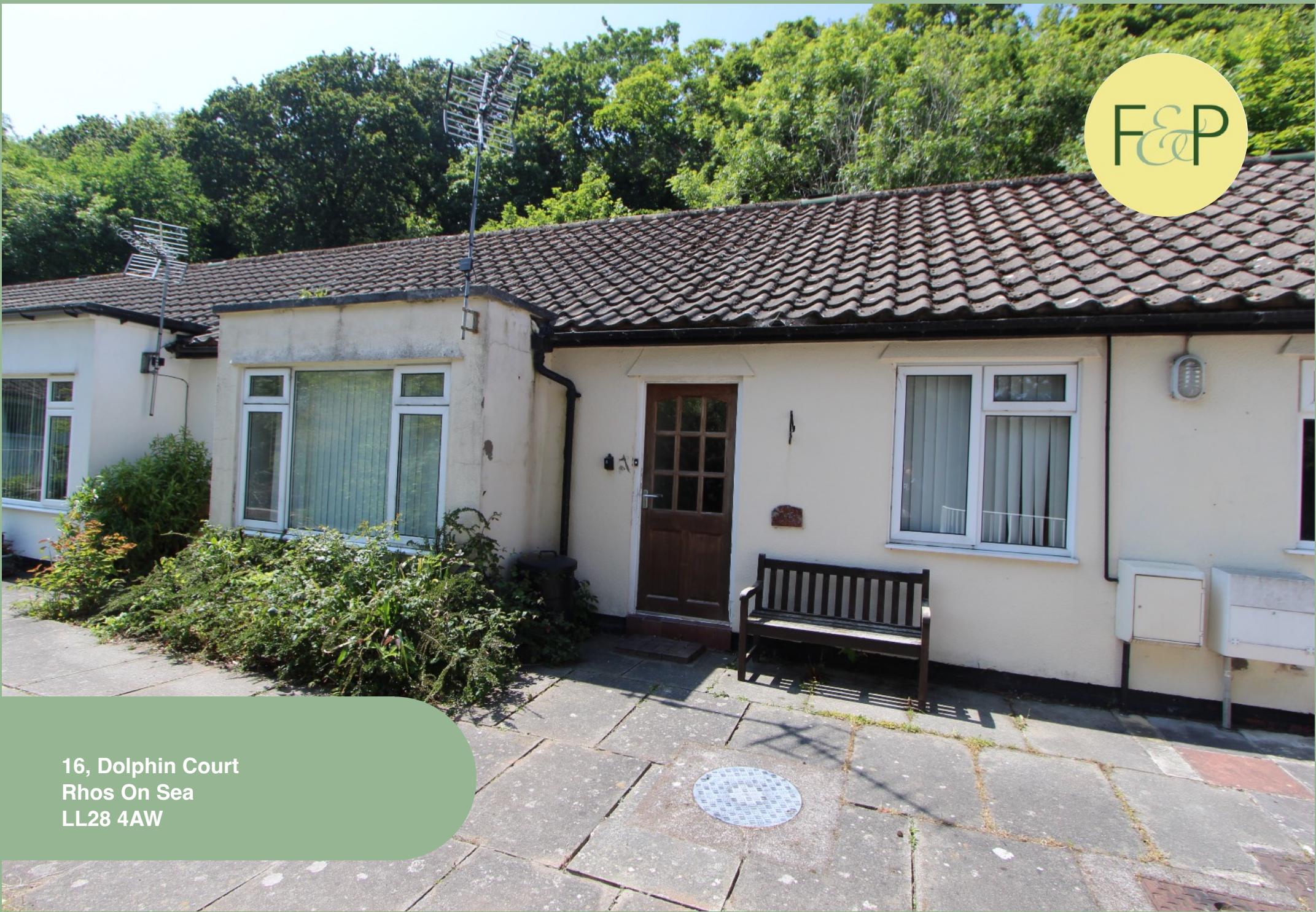
16, Dolphin Court Rhos On Sea LL28 4AW