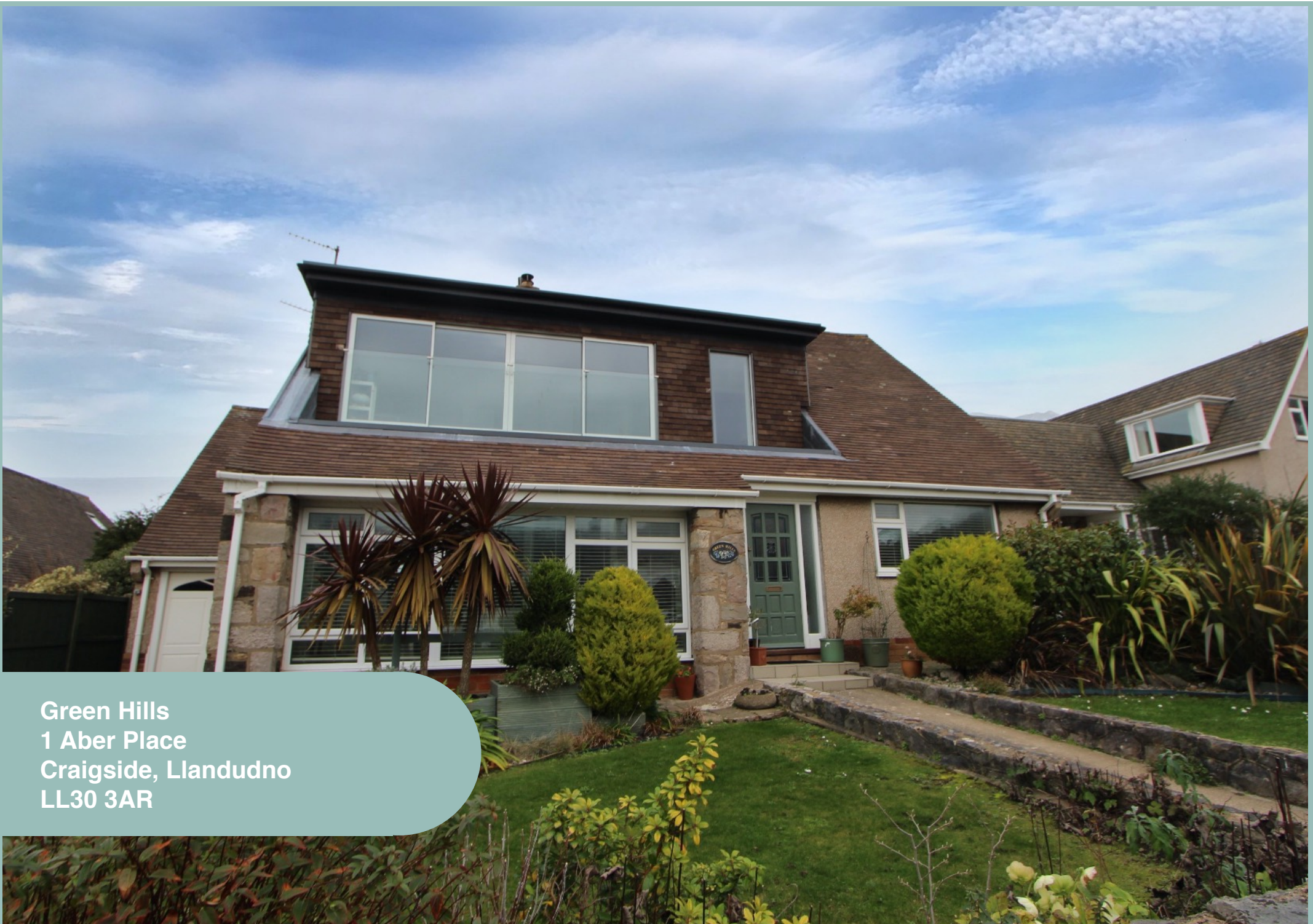
Green Hills 1 Aber Place Craigside, Llandudno LL30 3AR