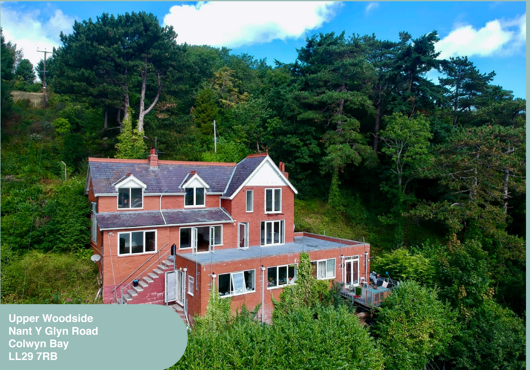
Upper Woodside Nant Y Glyn Road Colwyn Bay LL29 7RB