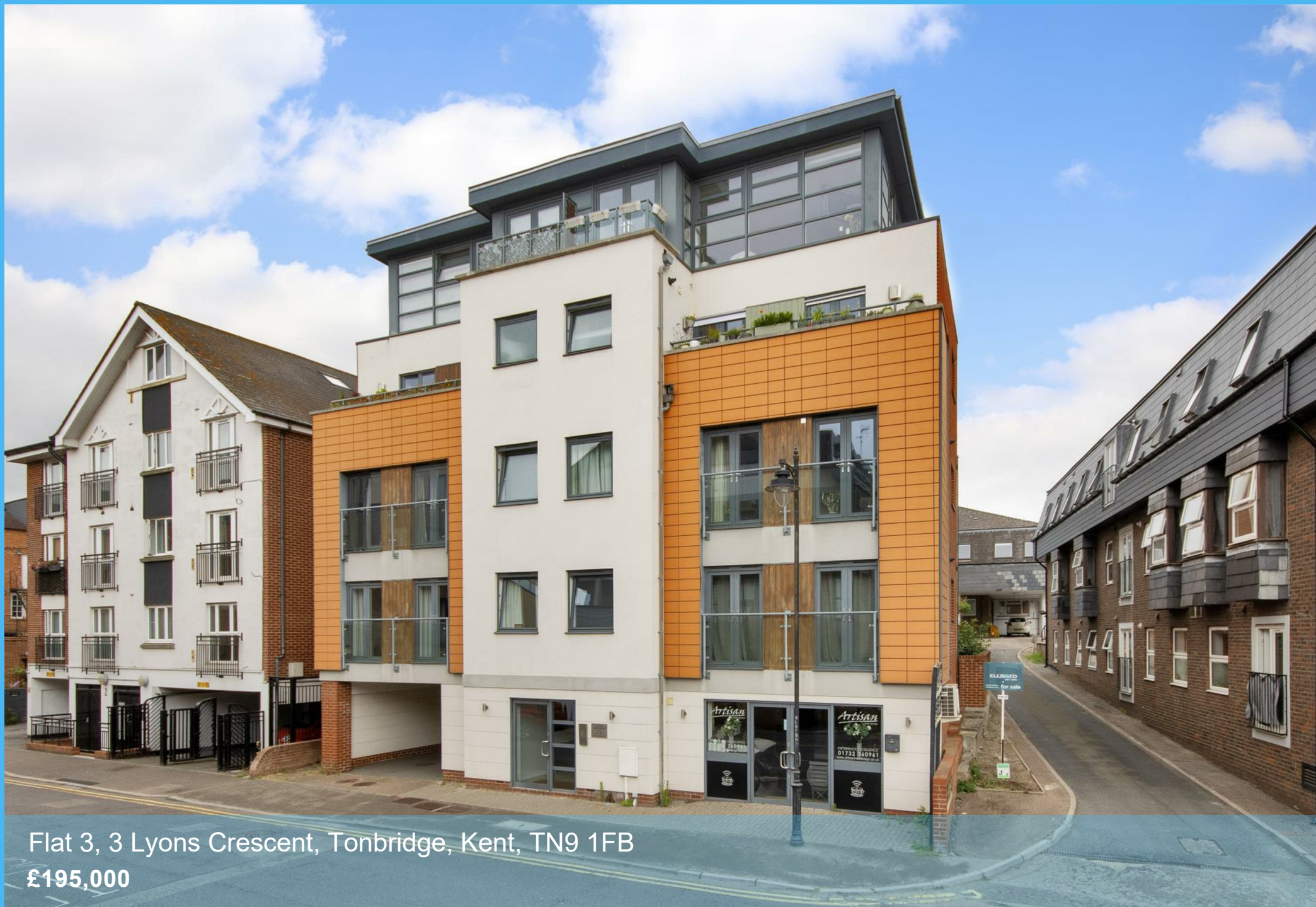
Flat 3, 3 Lyons Crescent, Tonbridge, Kent, TN9 1FB £195,000