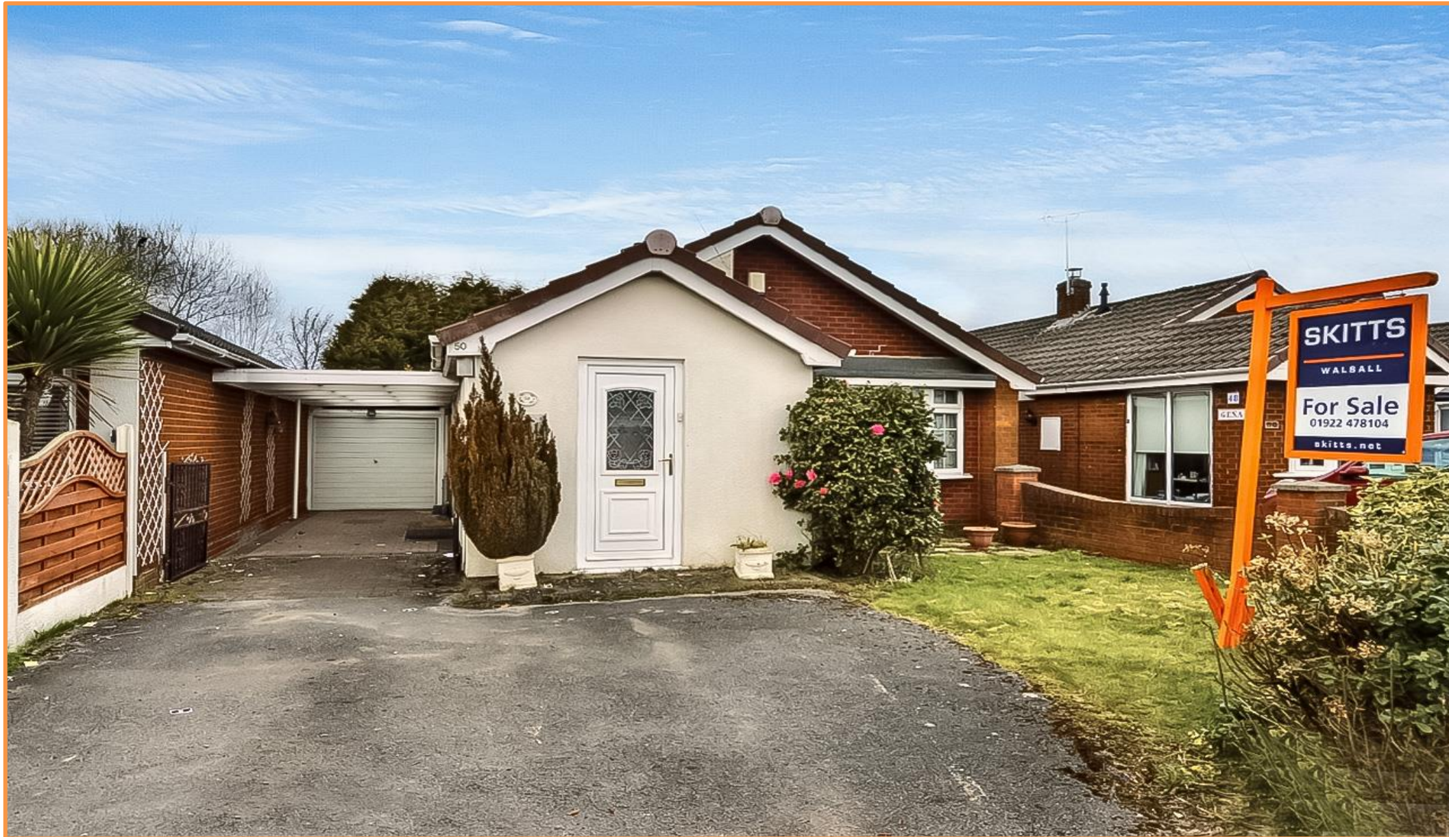
Cherrington Drive, Great Wyrley, WS6 6NE