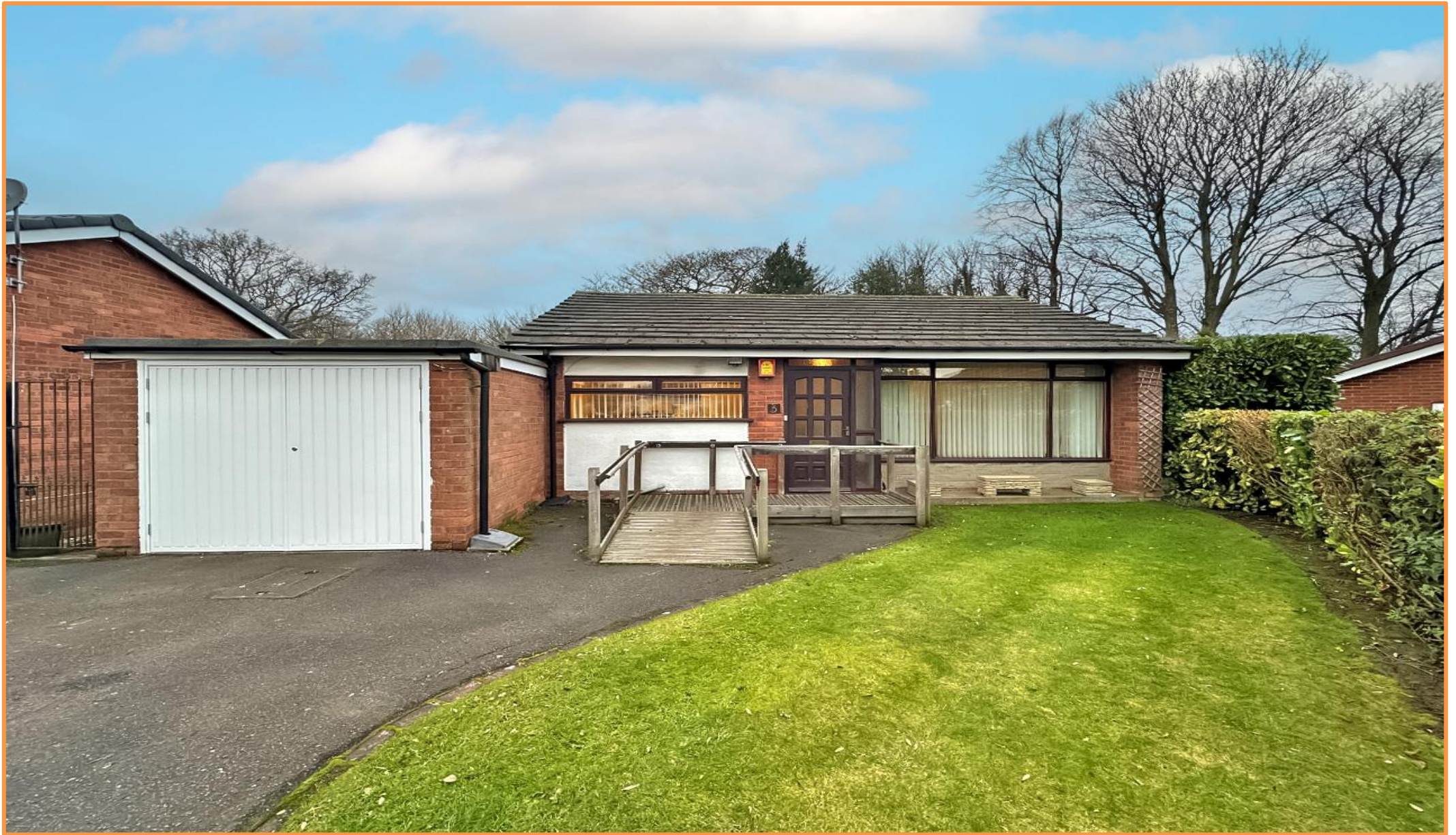
Enderley Close, Bloxwich, WS3 3PF