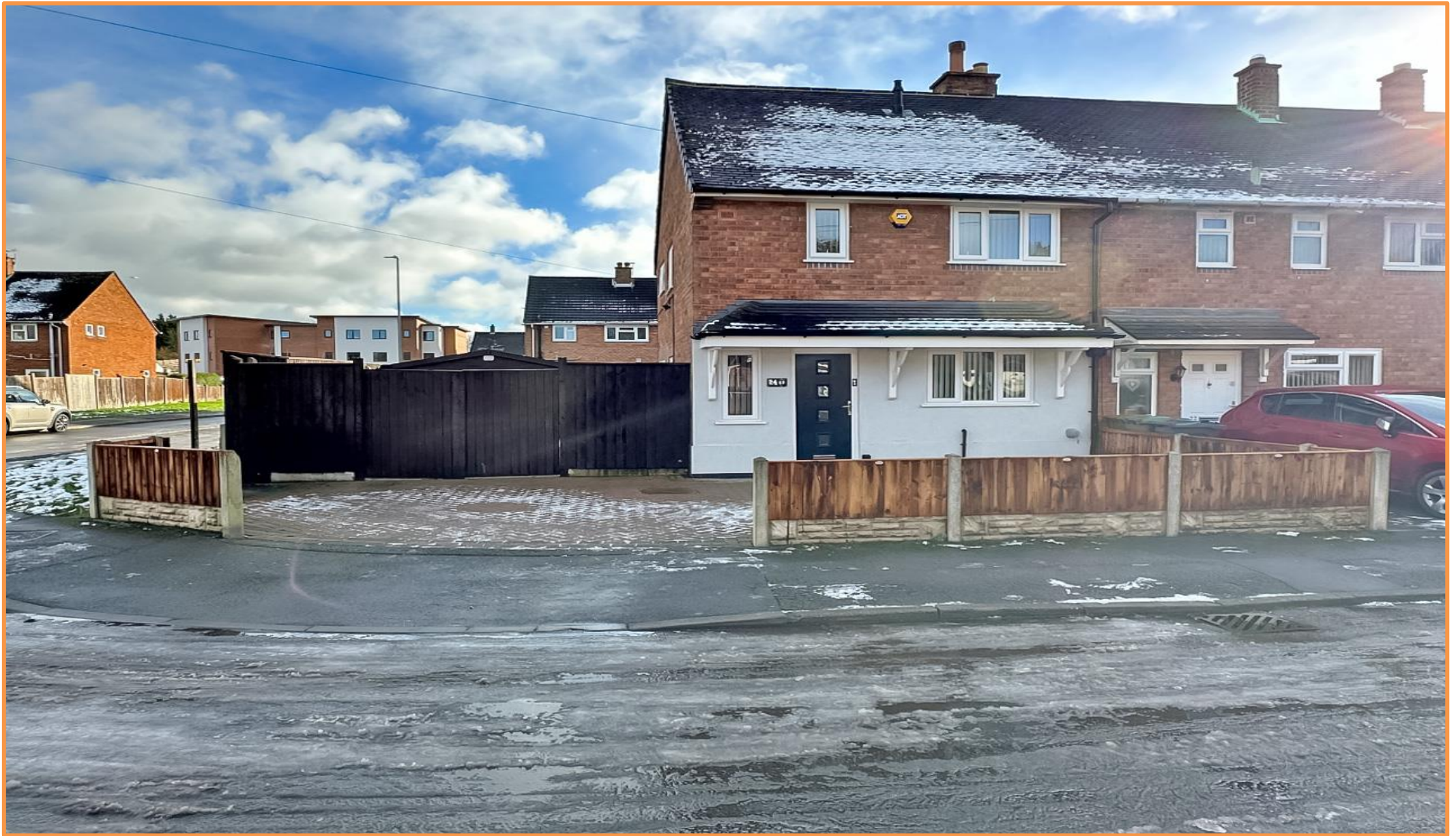
Evesham Crescent, Mossley Estate Bloxwich, WS3 2TN