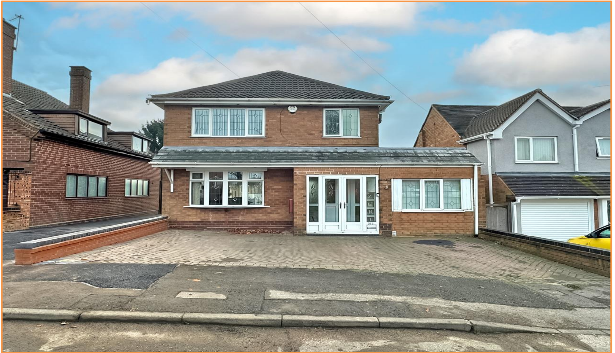
Sneyd Lane, Bloxwich Walsall, WS3 2LS