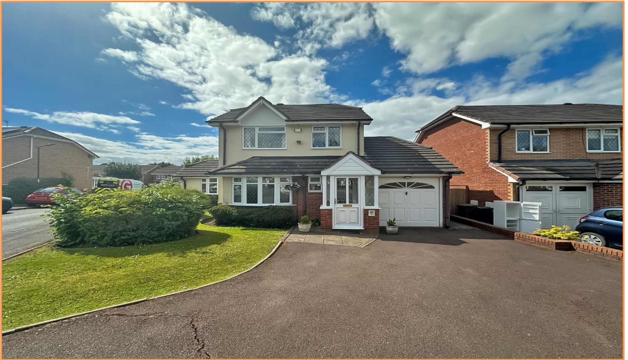
Nairn Road, Turnberry Estate Bloxwich, WS3 3XA