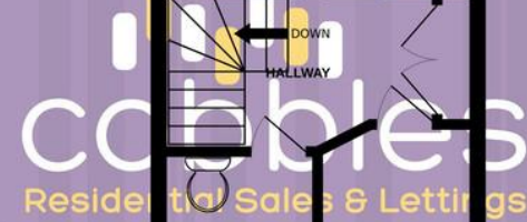
TOTAL FLOOR AREA : 598 sq.ft. (55.5 sq.m.) approx.

Whilst every attempt has been made to ensure the accuracy of the floorplan contained here, measurements of doors, windows, rooms and any other items are approximate and no responsibility is taken for any error, omission or mis-statement. This plan is for illustrative purposes only and should be used as such by any prospective purchaser. The services, systems and appliances shown have not been tested and no guarantee as to their operability or efficiency can be given. Made with Metropix ©2024