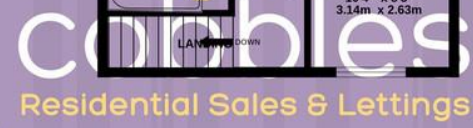
TOTAL FLOOR AREA : 1308 sq.ft. (121.5 sq.m.) approx.

Whilst every attempt has been made to ensure the accuracy of the floorplan contained here, measurements of doors, windows, rooms and any other items are approximate and no responsibility is taken for any error, omission or mis-statement. This plan is for illustrative purposes only and should be used as such by any prospective purchaser. The services, systems and appliances shown have not been tested and no guarantee as to their operability or efficiency can be given. Made with Metropix ©2023