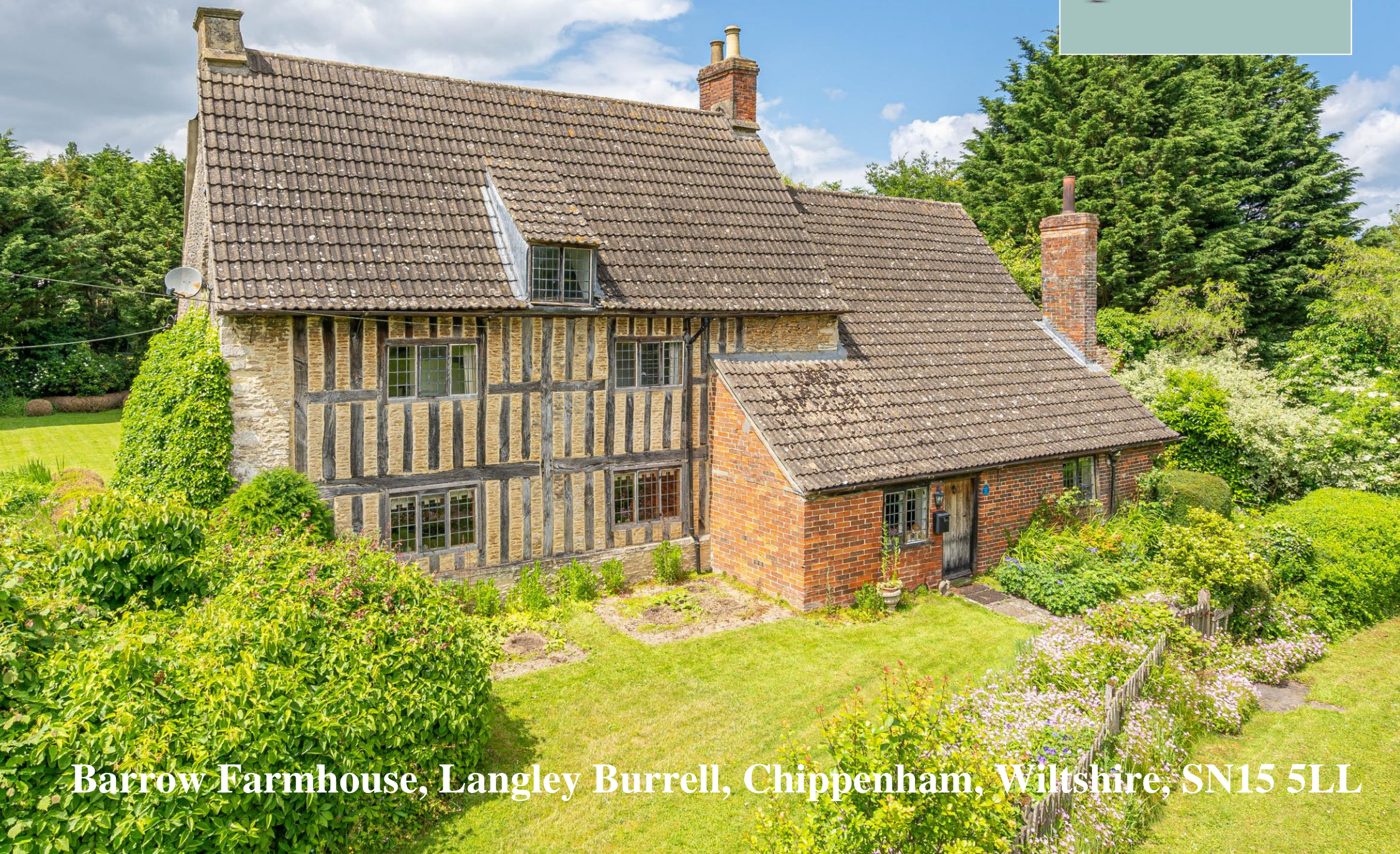
Barrow Farmhouse, Langley Burrell, Chippenham, Wiltshire, SN15 5LL