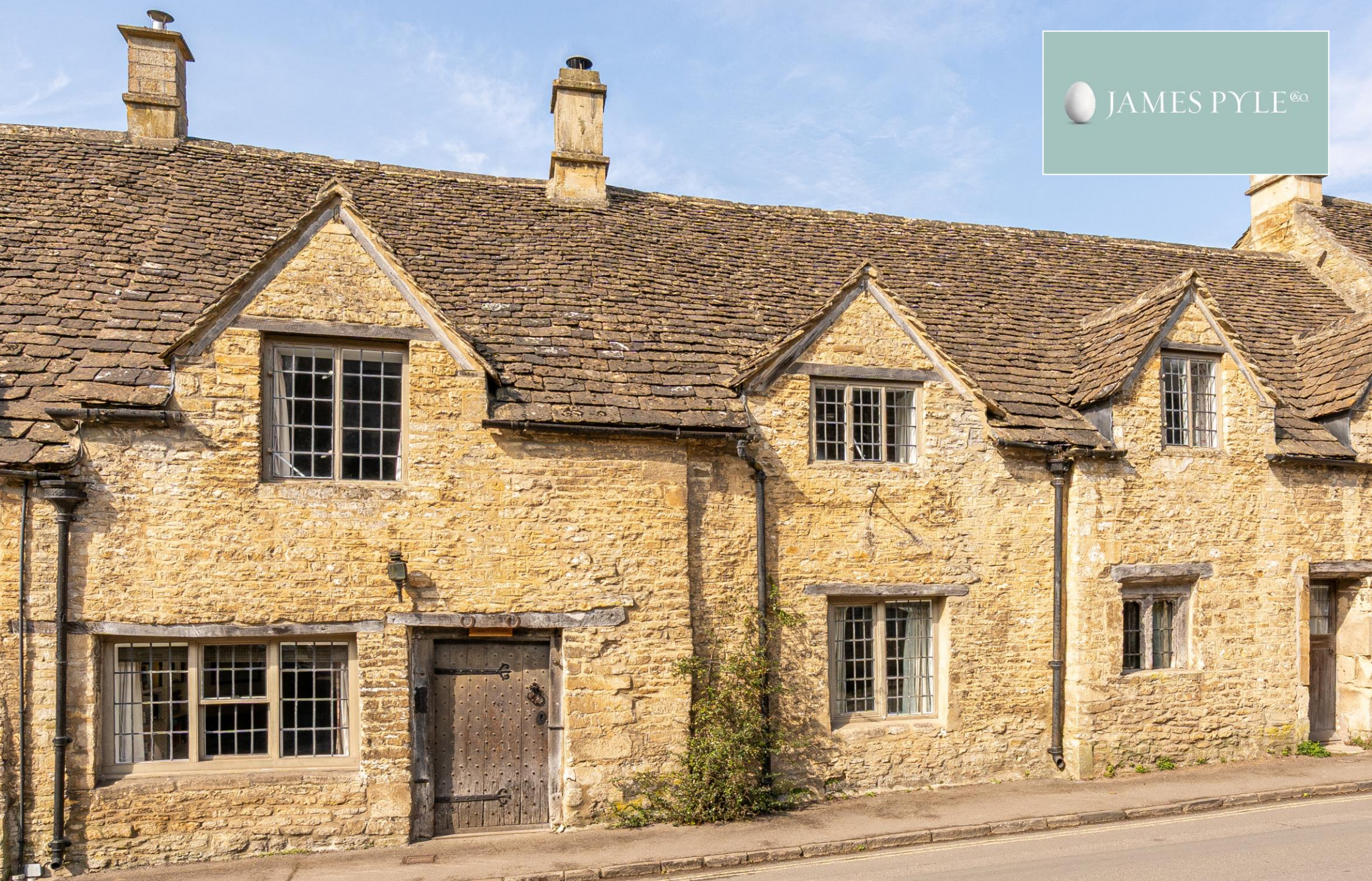
Corbett Cottage, The Street, Castle Combe, Chippenham, Wiltshire, SN14 7HU