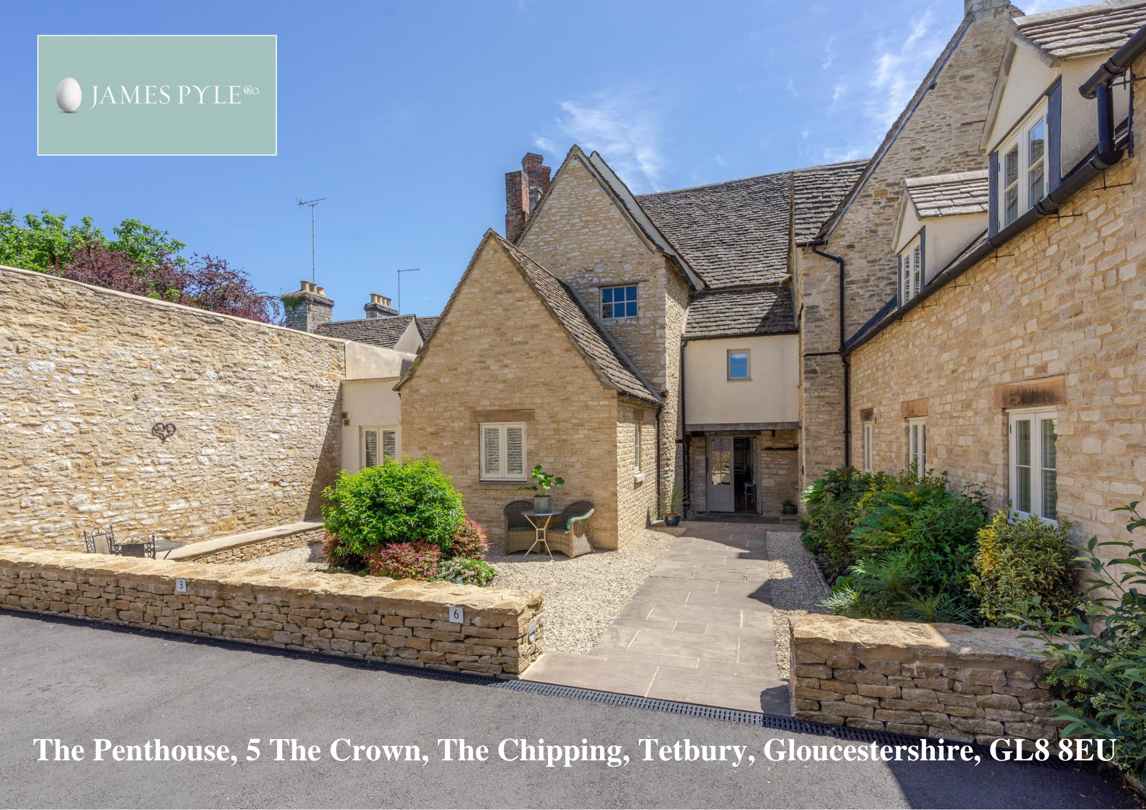
The Penthouse, 5 The Crown, The Chipping, Tetbury, Gloucestershire, GL8 8EU