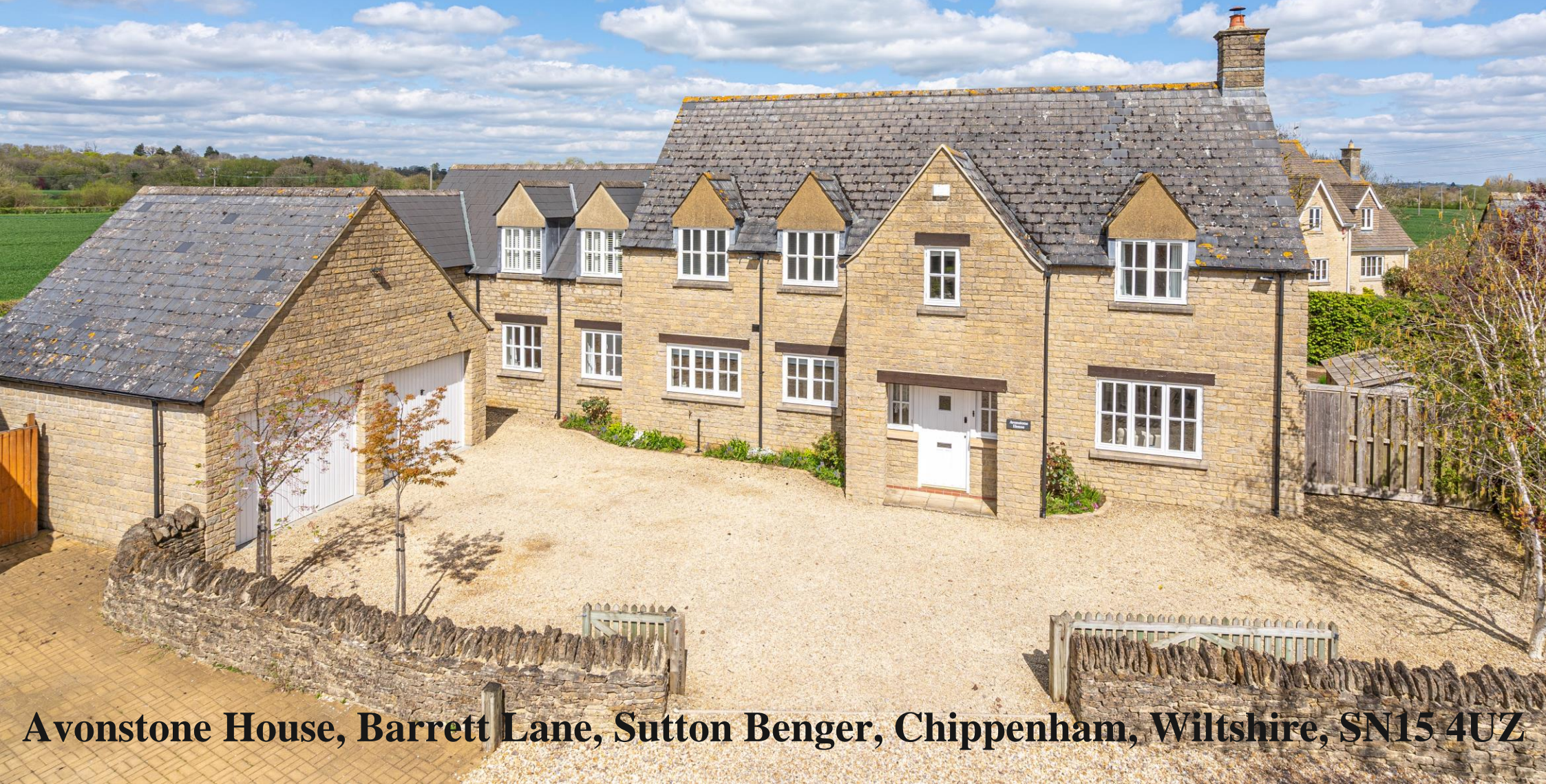
Avonstone House, Barrett Lane, Sutton Benger, Chippenham, Wiltshire, SN15 4UZ