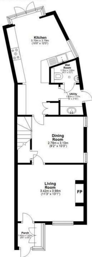
Main area: Approx. 90.1 sq. metres (969.7 sq. feet) Plus garages: approx. 19.5 sq. metres (210.4 sq. feet)