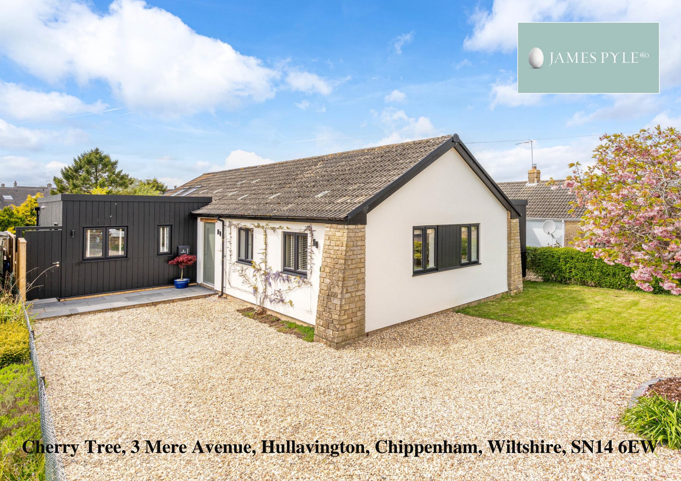
Cherry Tree, 3 Mere Avenue, Hullavington, Chippenham, Wiltshire, SN14 6EW