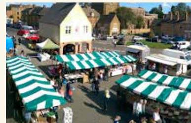
Deddington Farmers Market