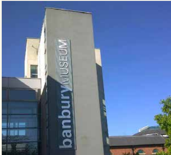
Banbury Museum Trust