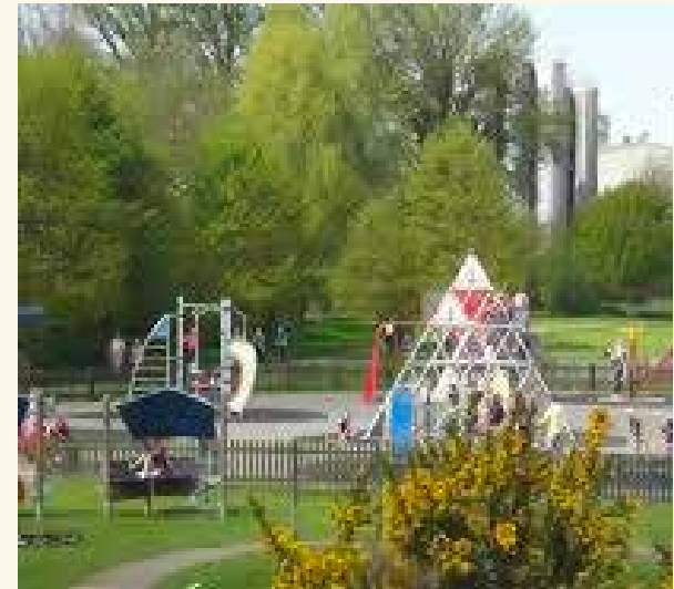
Spiceball Country Park