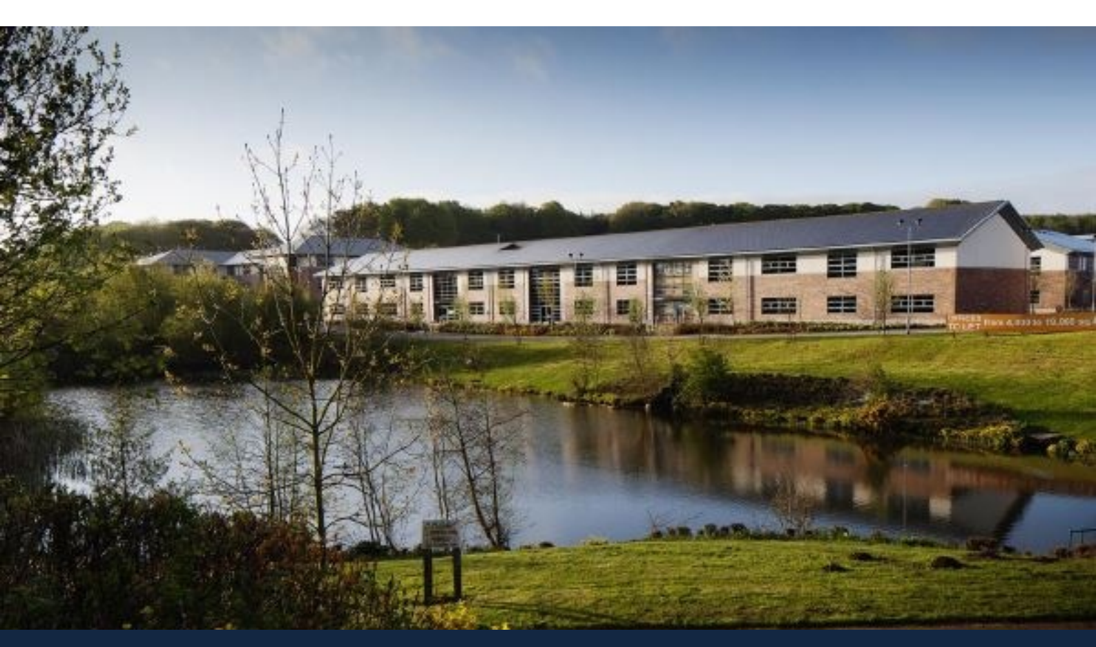
Como - Investment, Lakeview, Sherwood Park, Nottingham, Nottinghamshire NG15 OHT