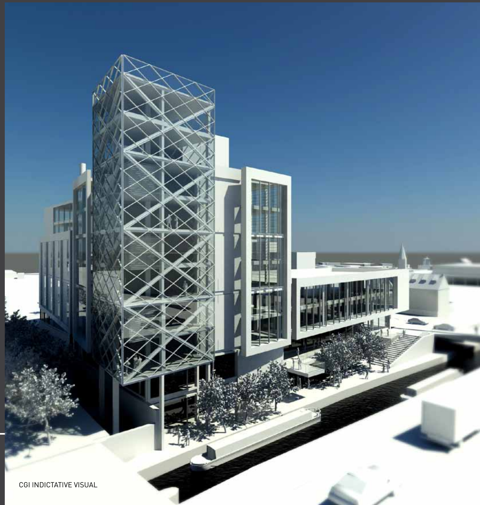
CGI INDICATIVE VISUAL

181,329 sq.ft (16,846m 2 ) of office space with on-site parking 3 phase development