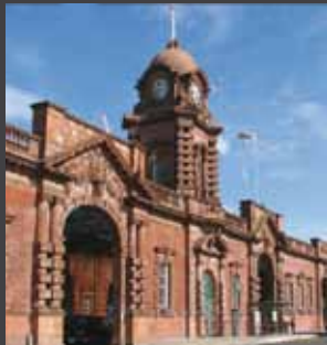
A CONNECTED CITY