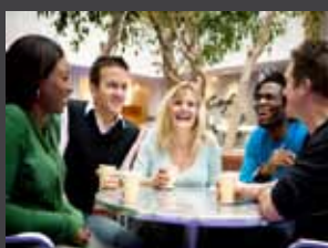
A SOCIABLE CITY