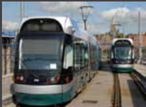
A SUSTAINABLE CITY