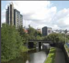
A GREEN CITY