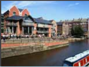
A WATERSIDE CITY