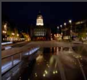
A DESIGN CITY