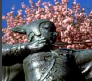
A CULTURED CITY