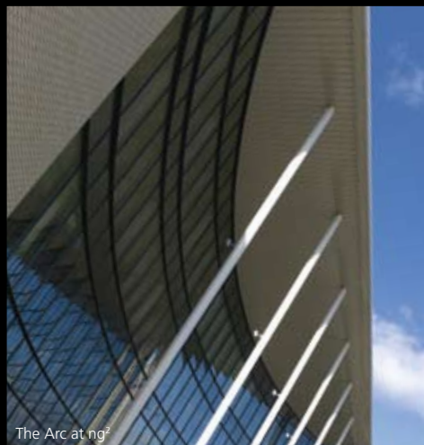
The Arc at ng 2