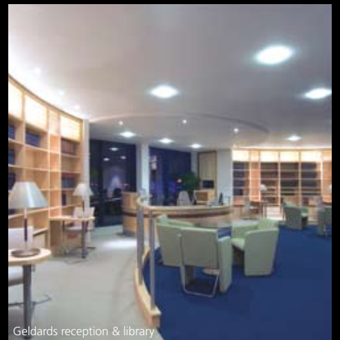
Geldards reception & library