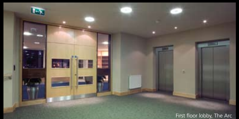
First floor lobby, The Arc