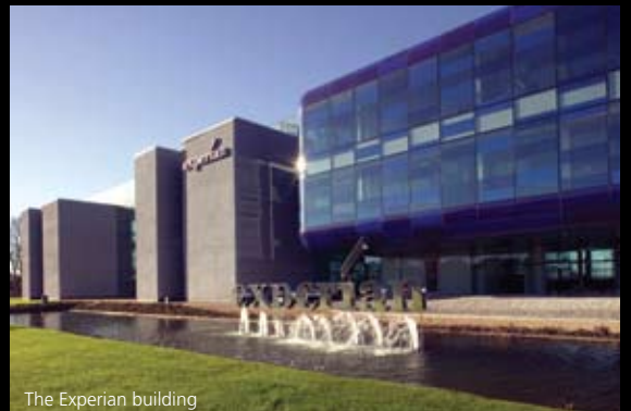
The Experian building