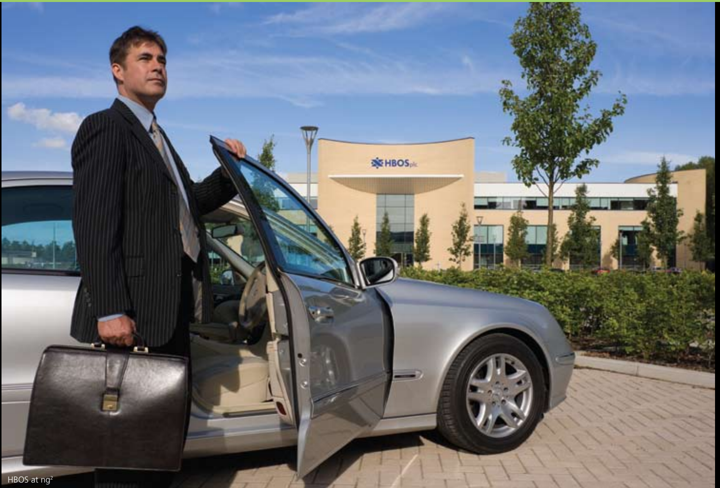
HBOS at ng 2