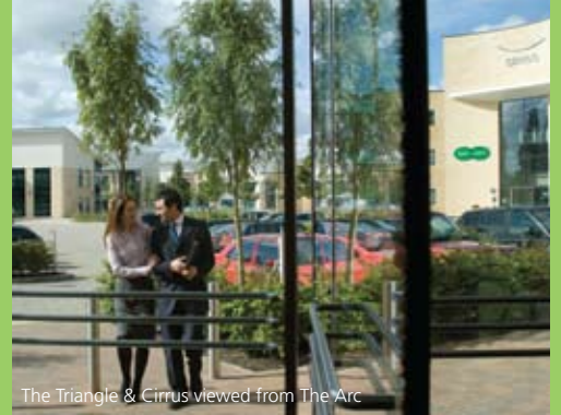
The Triangle & Cirrus viewed from The Arc