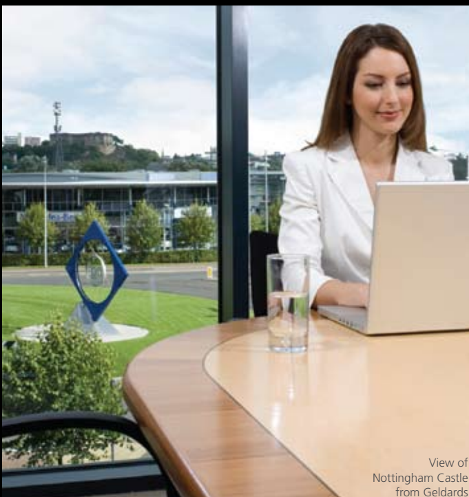
View of Nottingham Castle from Geldards