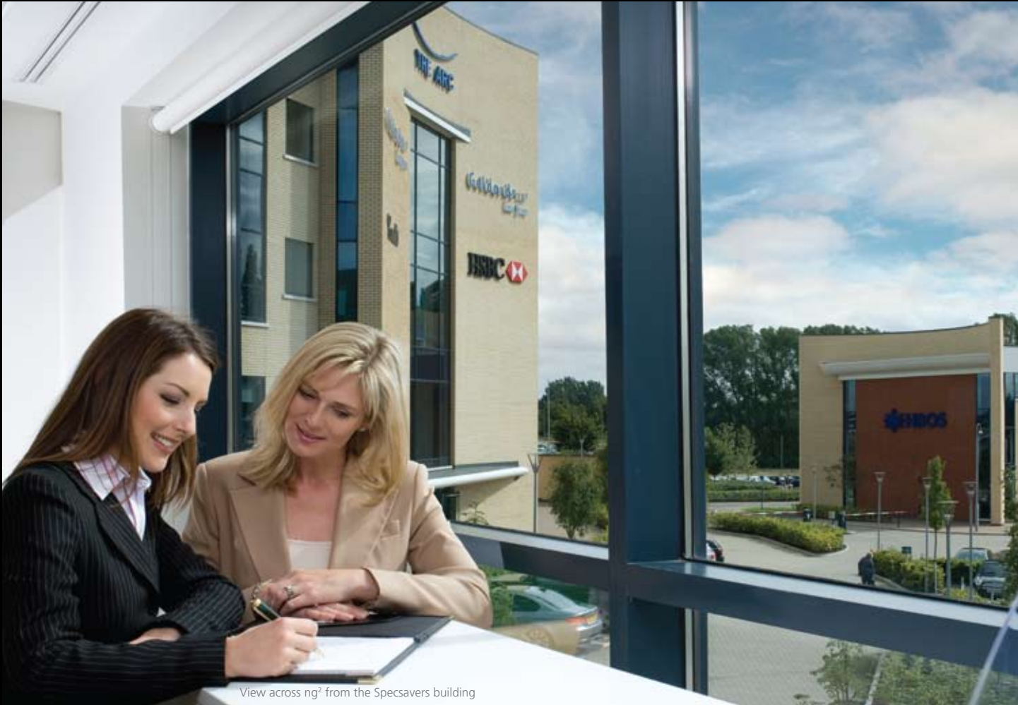
View across ng 2 from the Specsavers building