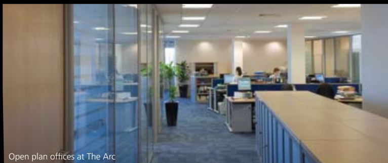
Open plan offices at The Arc