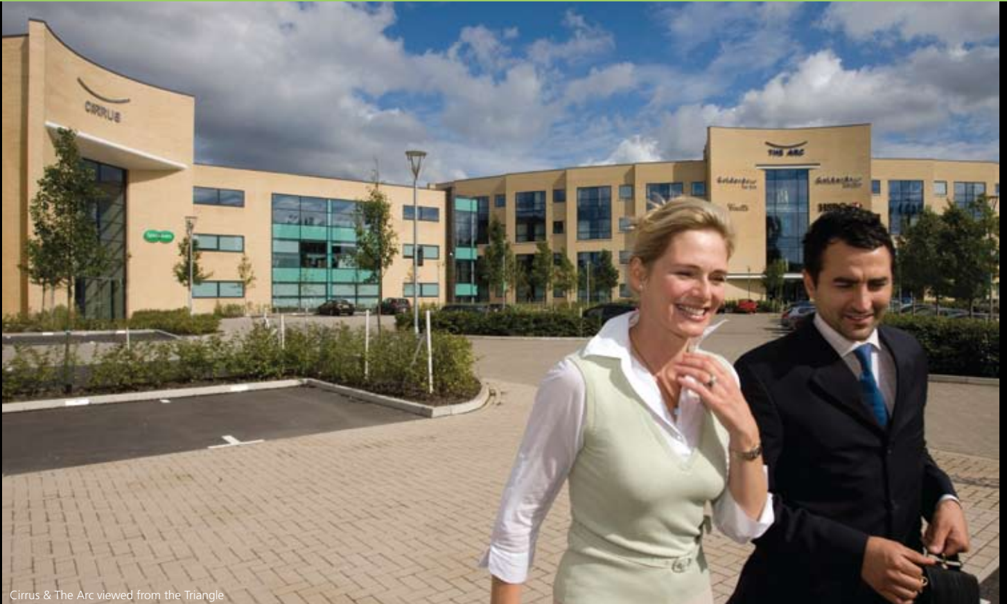
Cirrus & The Arc viewed from the Triangle

ng 2 is a landmark development. Its location and quality have attracted some of the UK's biggest names. Highly specified, architecturally striking buildings have made it more than the best business address in Nottingham, ng 2 is now one of the most sought after office locations in the Midlands.