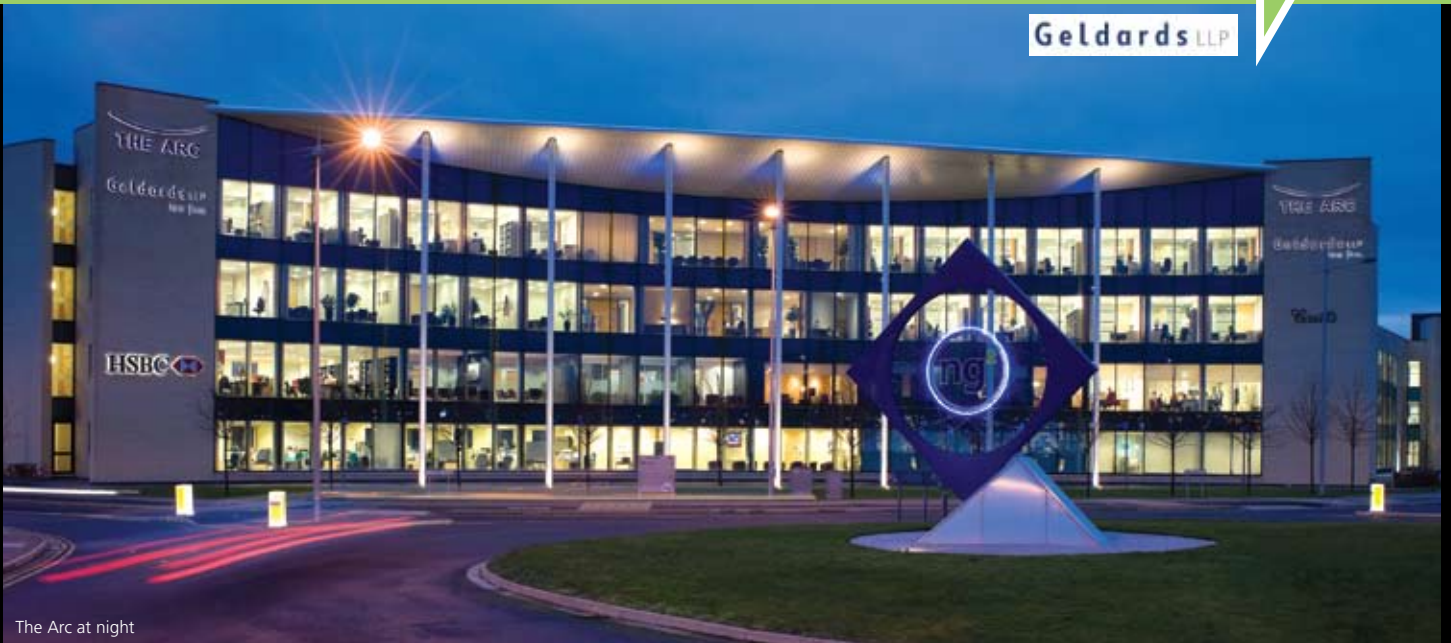
The Arc at night