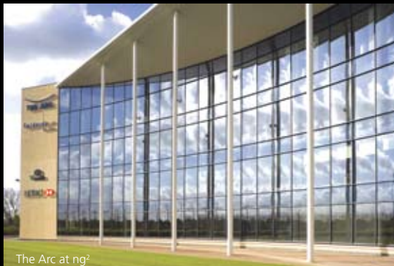
The Arc at ng 2