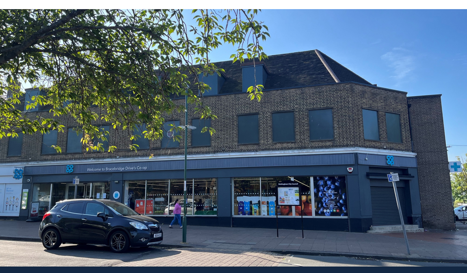
First Floor, 73-75 Bracebridge Drive, Nottingham, Nottinghamshire NG8 4PH