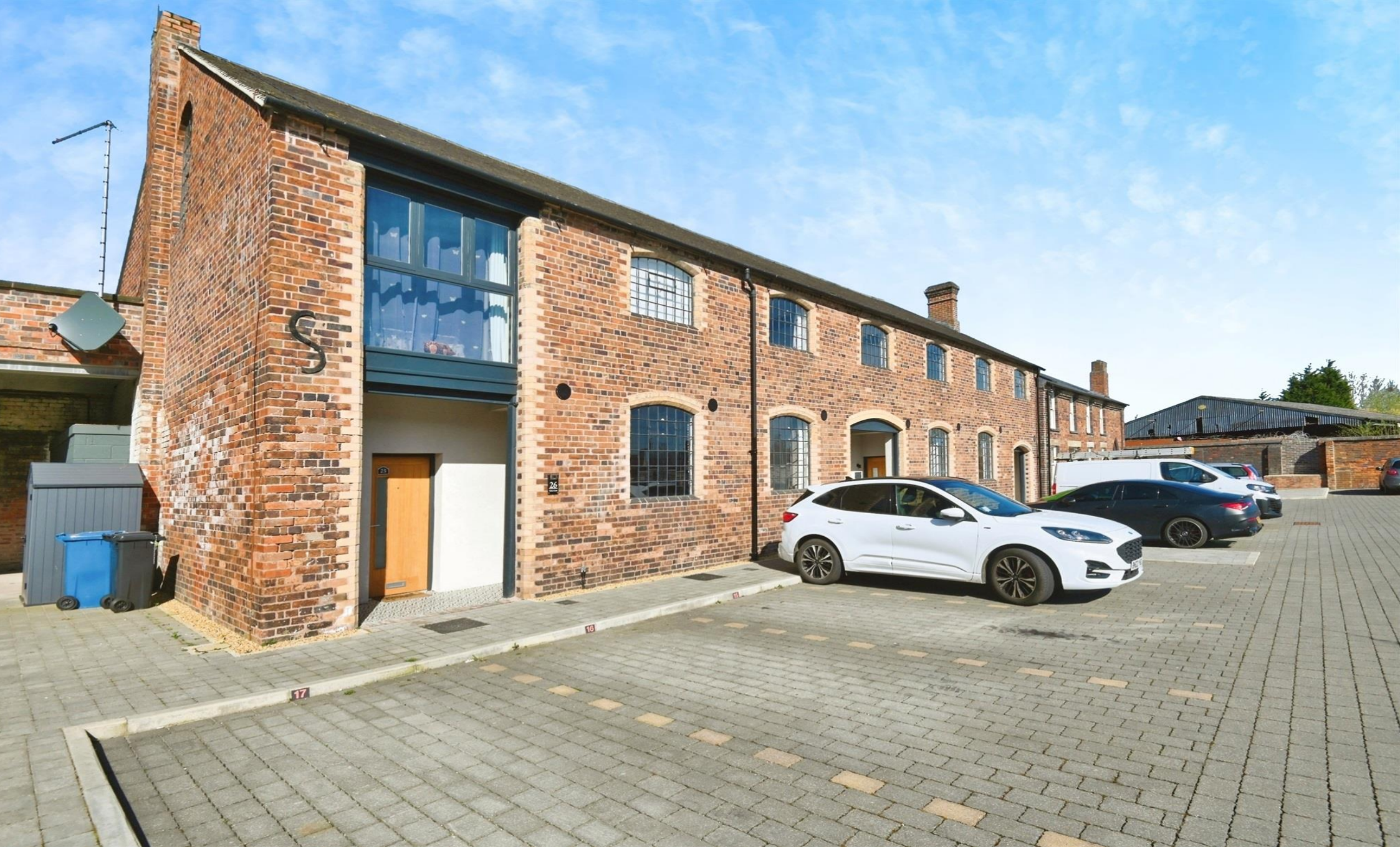
Tolson Court, Fazeley Tamworth