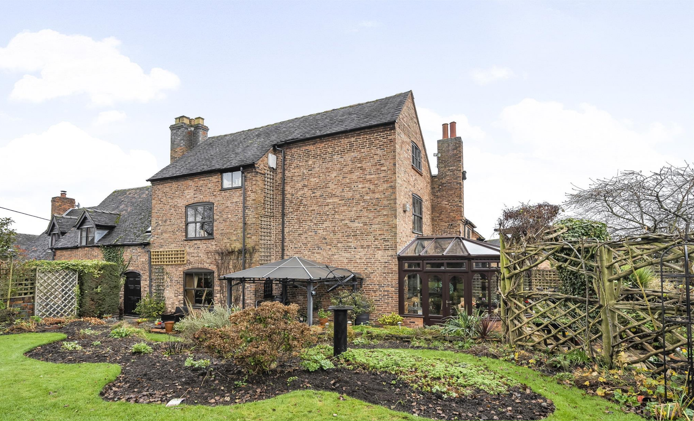
Church Farm Mews, Dosthill Tamworth