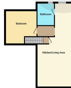
Garage First Floor

This floorplan is for illustrative purposes only and is not drawn to scale. Measurements, floor-areas, openings and orientations are approximate. They should not be relied upon for any purpose and do not form any part of an agreement. No liability is taken for any error or mis-statement. All parties must rely on their own inspections.