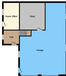
Garage Ground Floor