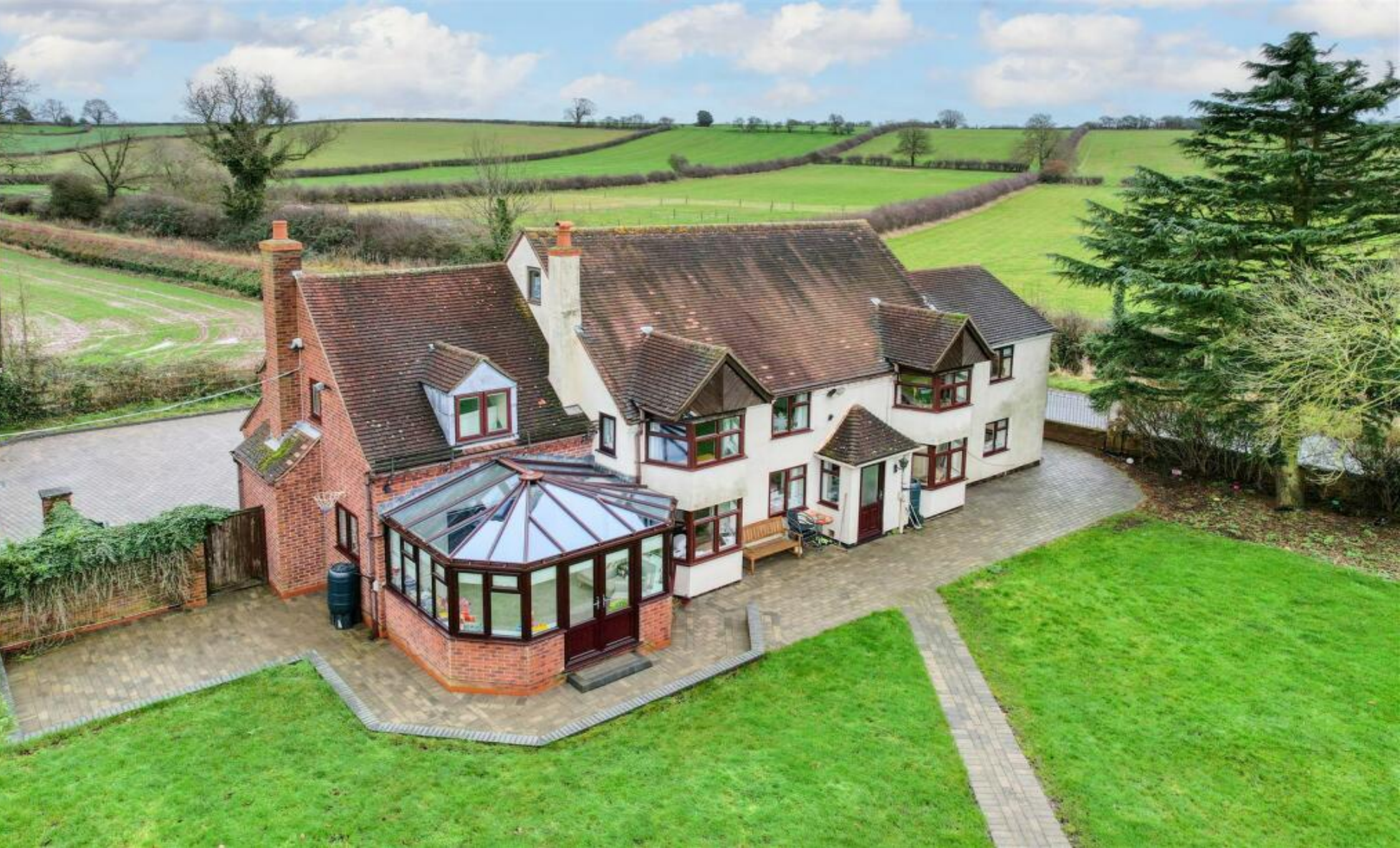
Orchard House Appleby Hill, Austrey Atherstone