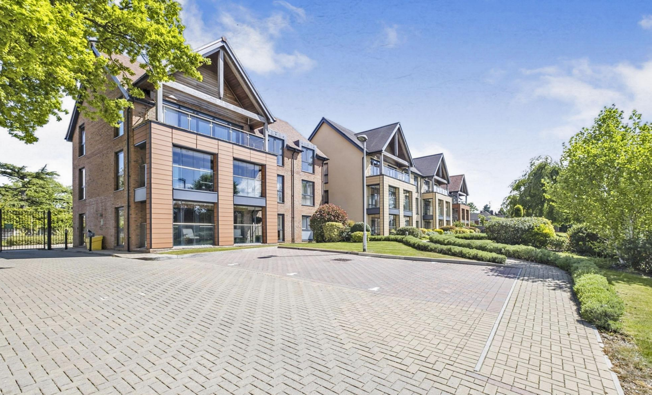
Scarlet Oak, Warwick Road, Solihull