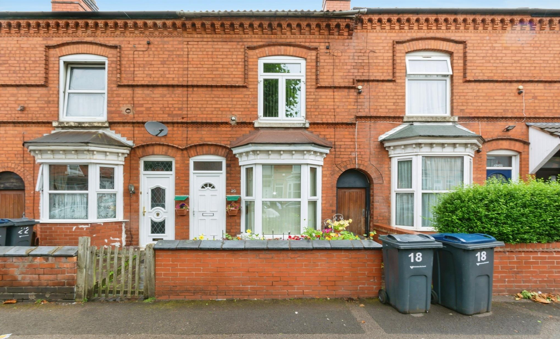
Roderick Road, Birmingham