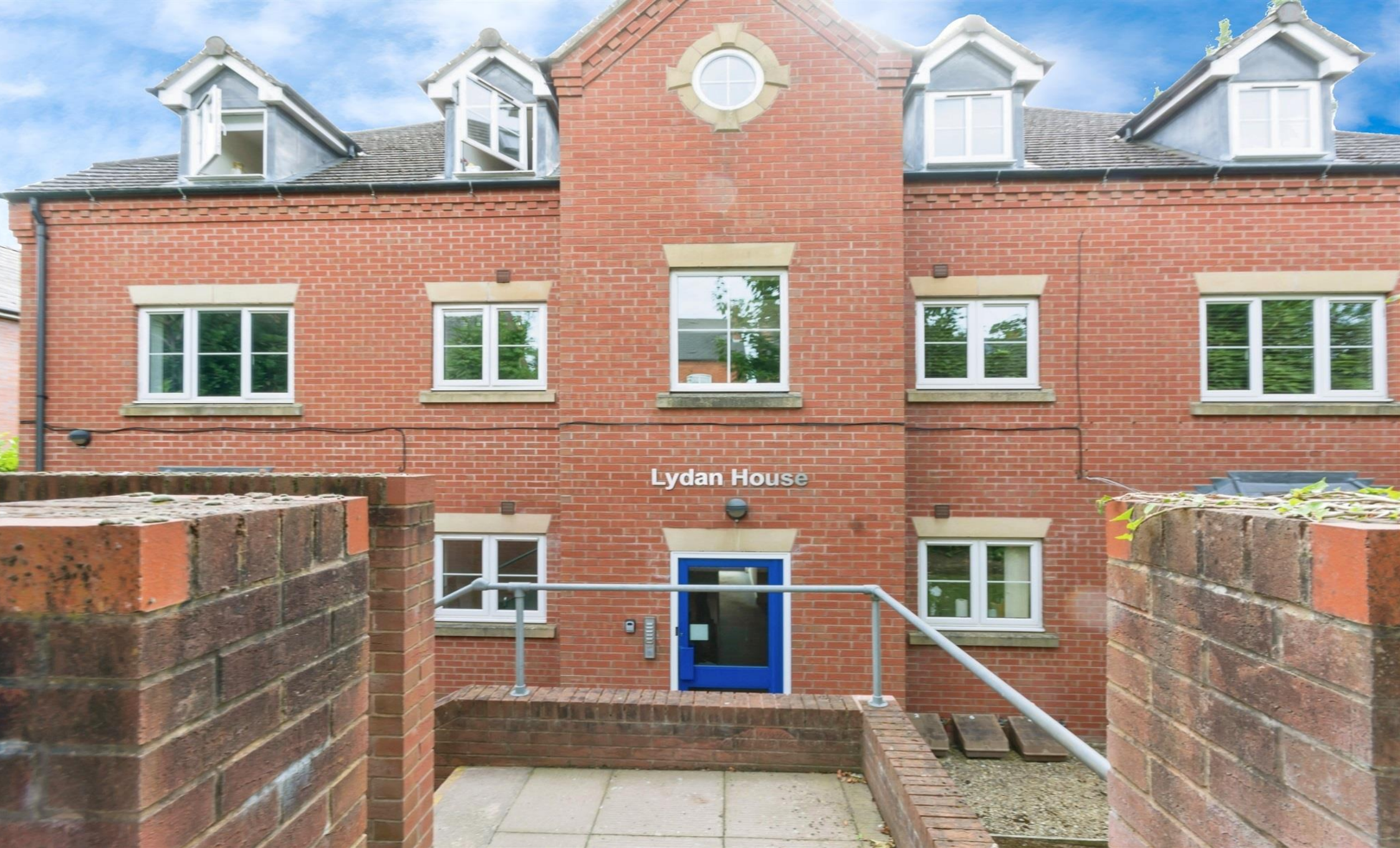
Lydan House Pool Bank, Redditch