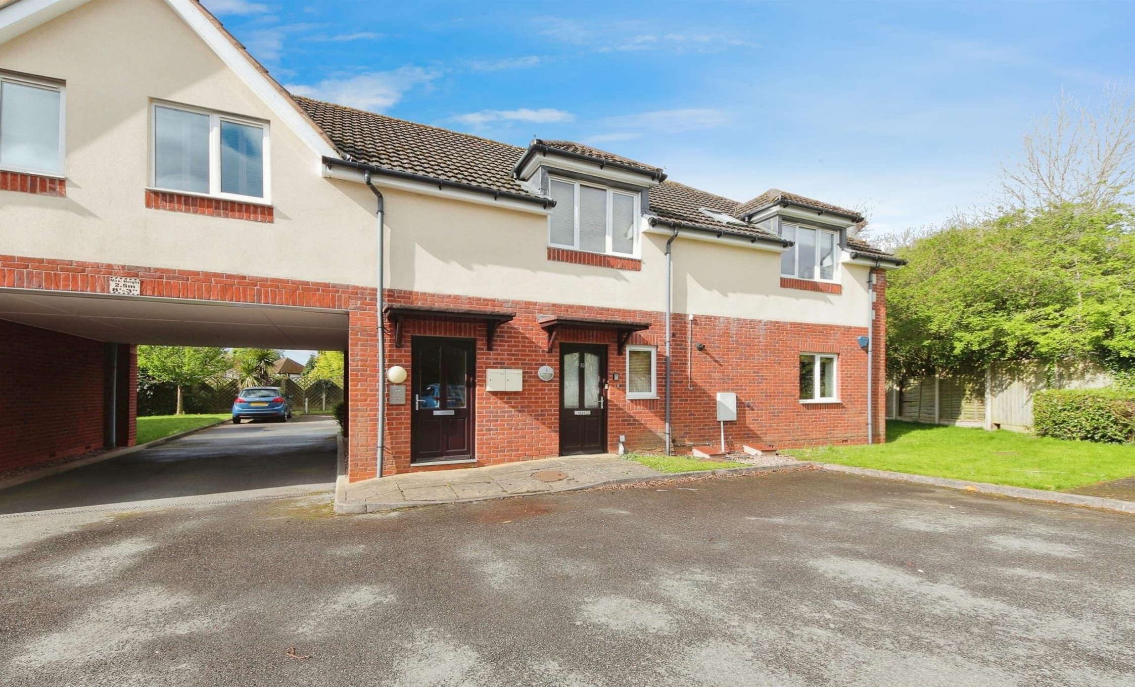
Haslucks Court Haslucks Green Road, Shirley Solihull