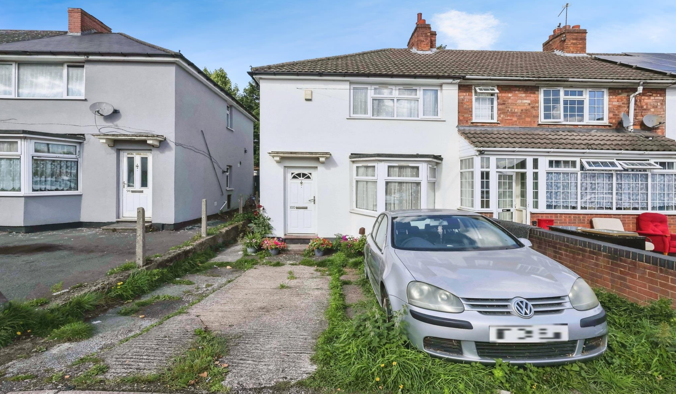
Kenwood Road, Birmingham