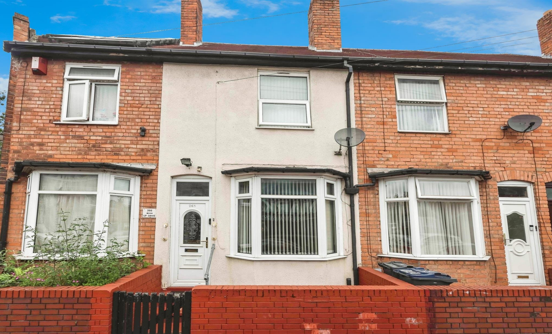
Cherrywood Road, Birmingham