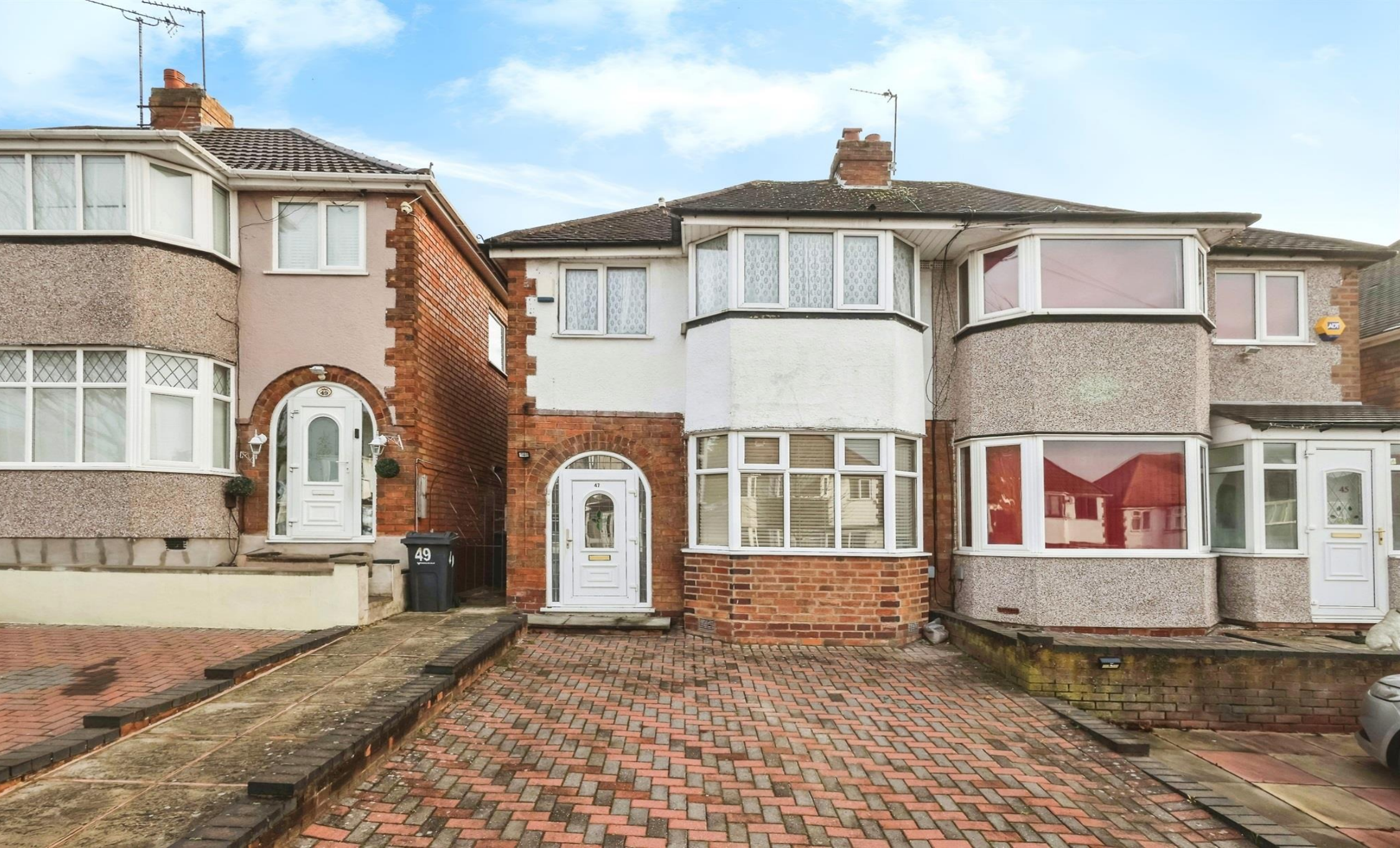
Coalway Avenue, Birmingham