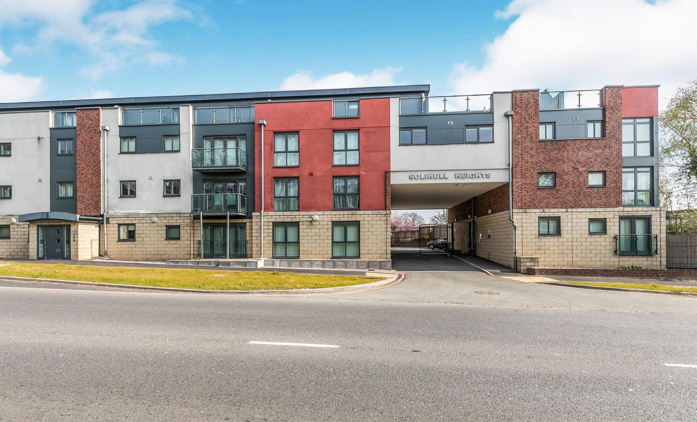
Solihull Heights New Coventry Road, Birmingham