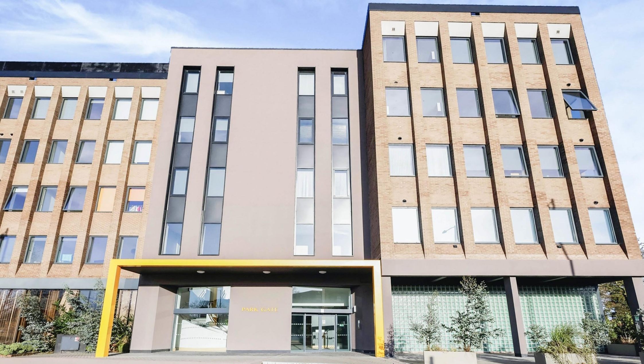
Parkgate At Lyndon Place Coventry Road, Sheldon Birmingham