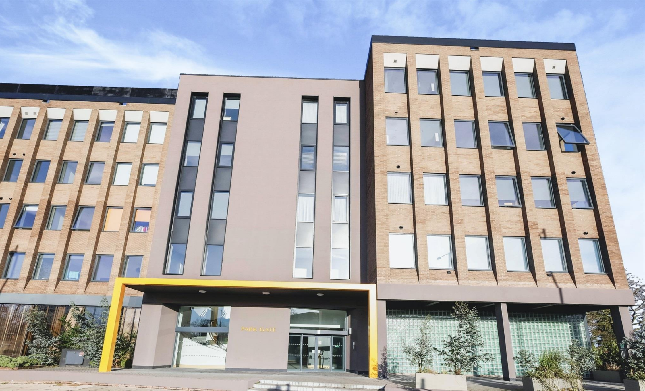
Parkgate At Lyndon Place, Coventry Road, Sheldon, Birmingham